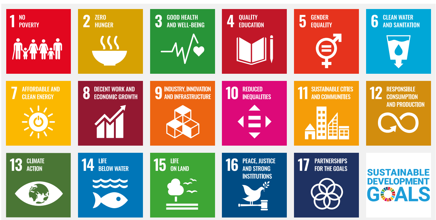
Figure 2: UN Sustainable Development Goals

The National Development Plan 2018-2027 provides the accompanying investment strategy which aligns with the strategic objectives of the NPF.