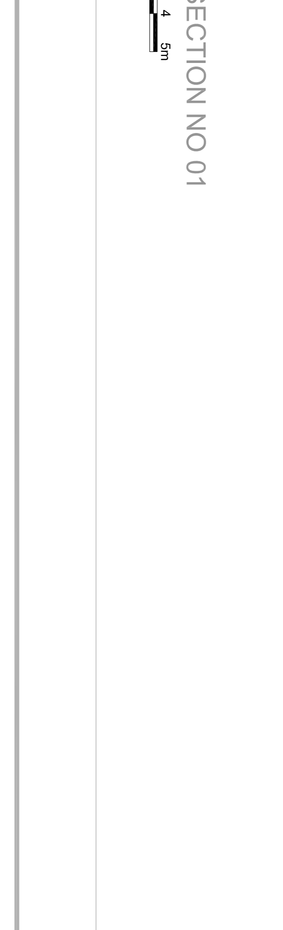
EXISTING SECTION NO 01