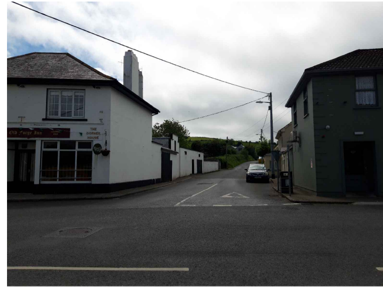
Picture 3: Existing pathway/pedestrian refuge to east side of Cluain Dara road