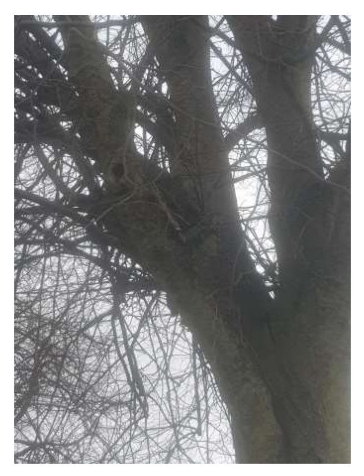
Plate 1: Lime tree