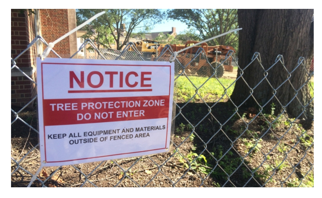
Fig. 4 Signage to be placed on all protective fencing

* The above displays an example of a suitable protective barrier as recommended by BS. 5837 2012 Trees in Relation to Construction. Recommendations.