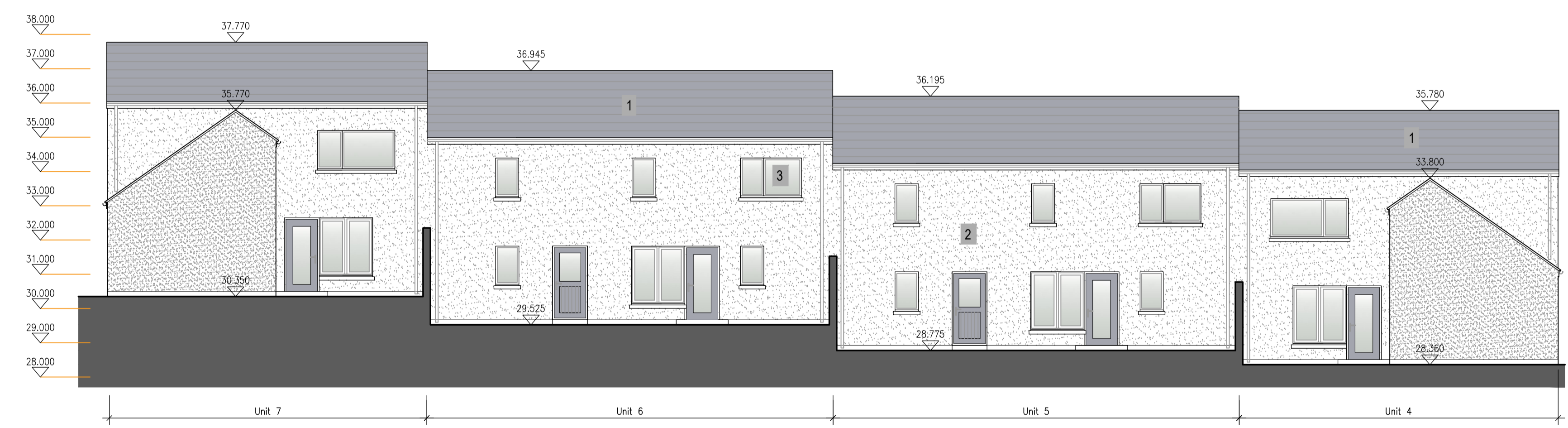
Contiguous Elevation E Scale 1:100