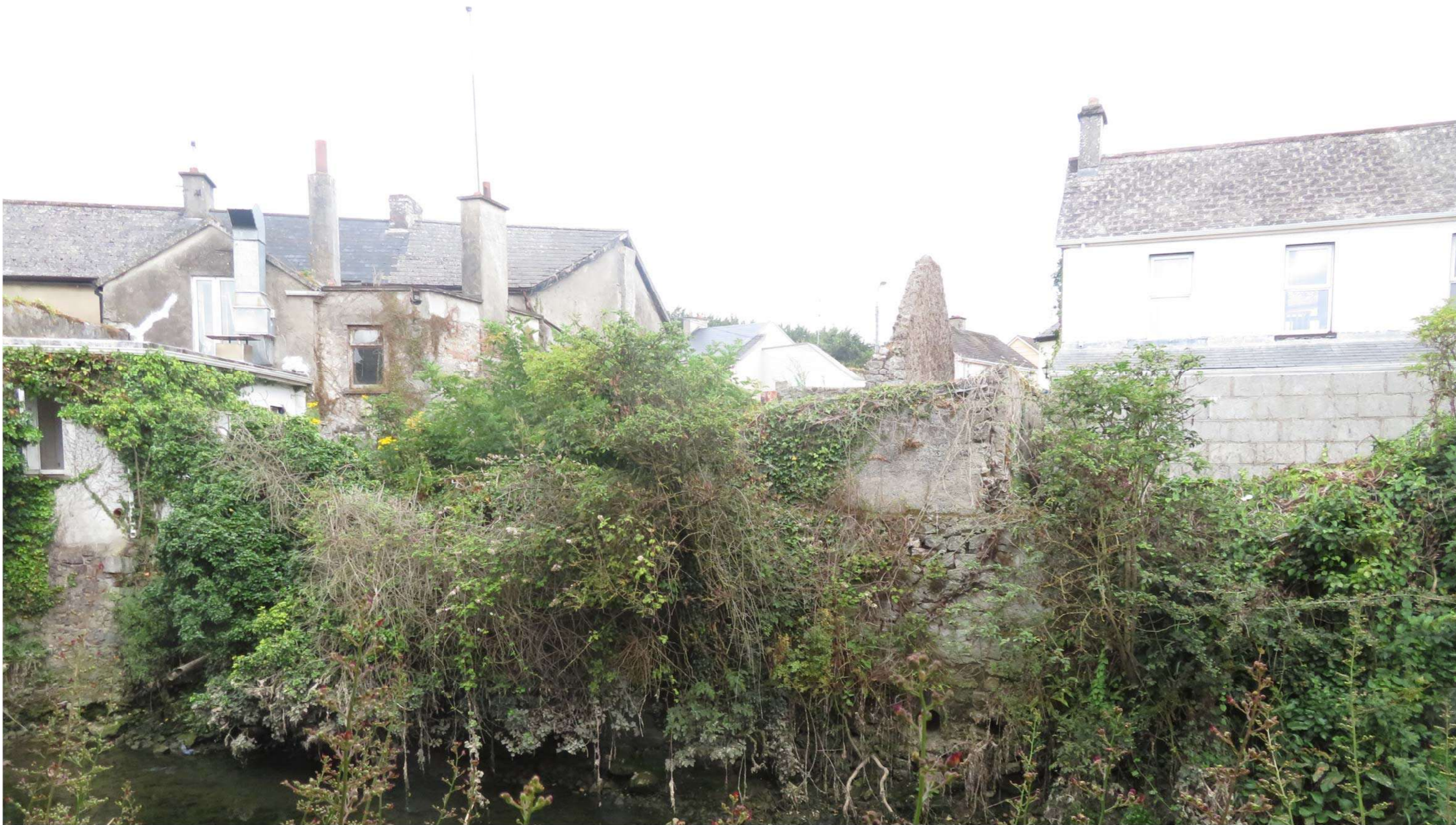
EXISTING VIEW FROM THE RIVER DEEL