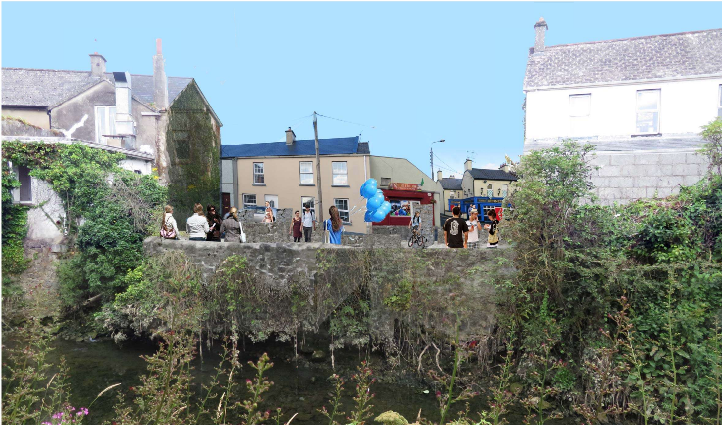
PROPOSED VIEW FROM THE RIVER DEEL