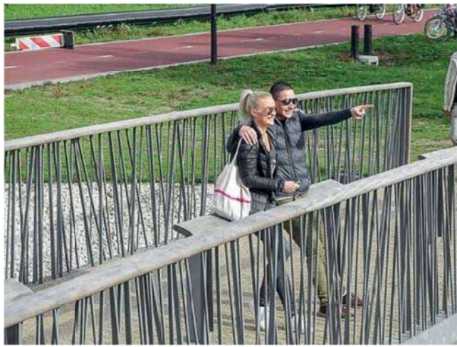
Oak Handrail on Stainless Steel Balustrade Painted