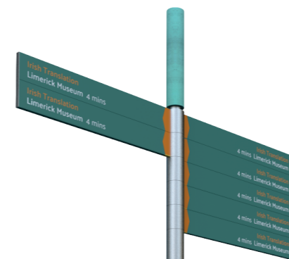
3D NOT TO SCALE