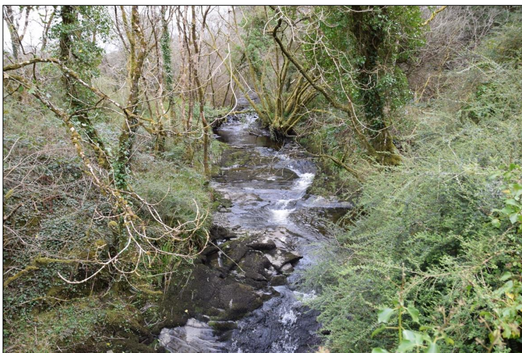
Plate 2 River Galey upstream of Ballinloughane Bridge.