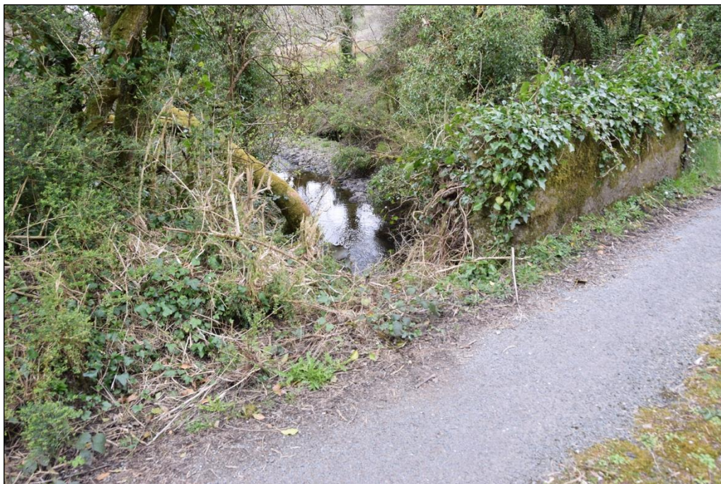
Plate 1 Ballinloughane Bridge over the River Galey in Co. Limerick.