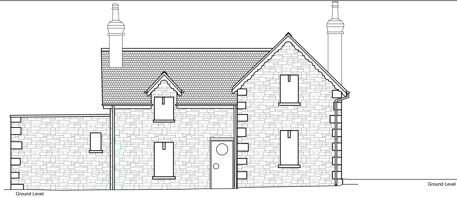
01 WEST ELEVATION SCALE 1:100