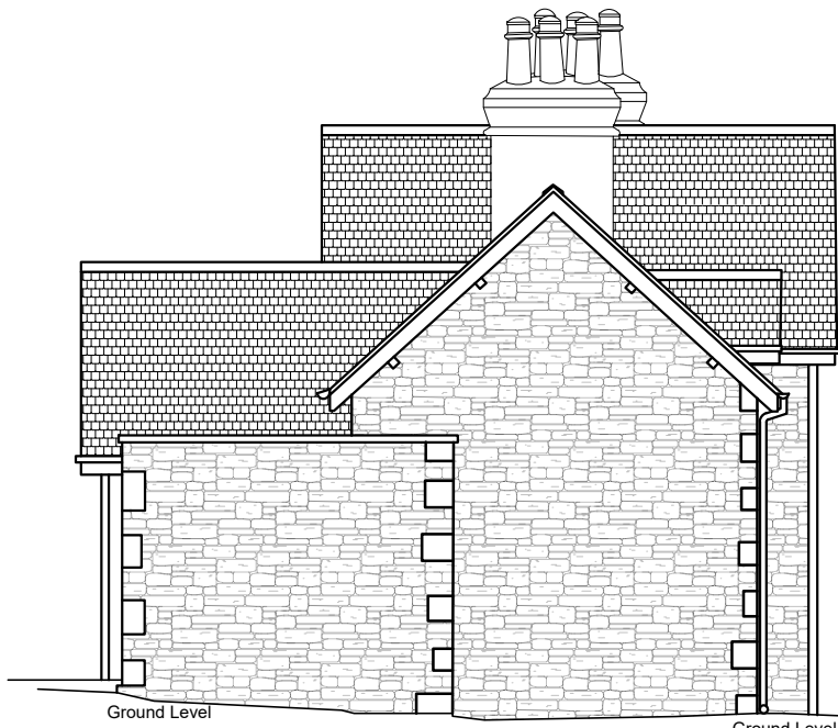
04 NORTH ELEVATION SCALE 1:100