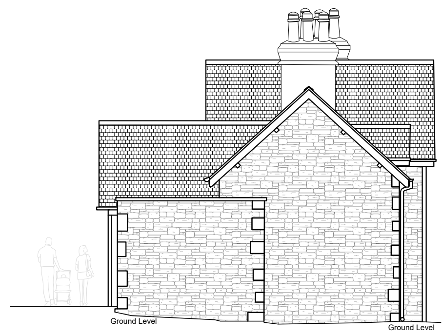
02 205 NORTH ELEVATION SCALE 1:100