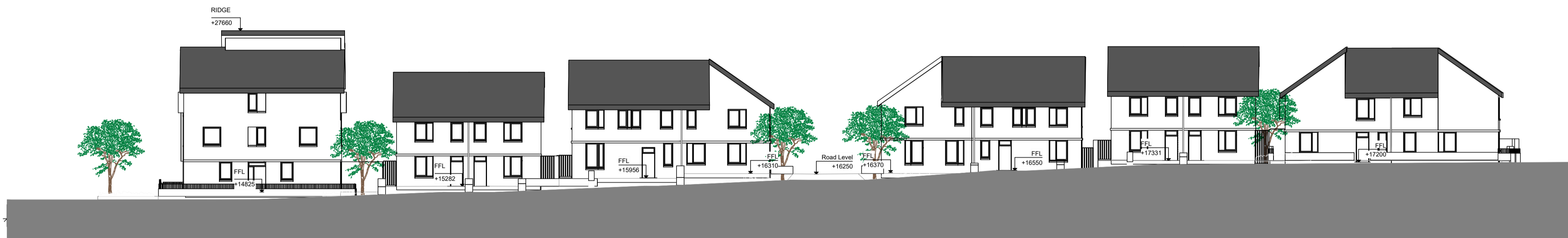
9 Elevation.CC Not To Scale