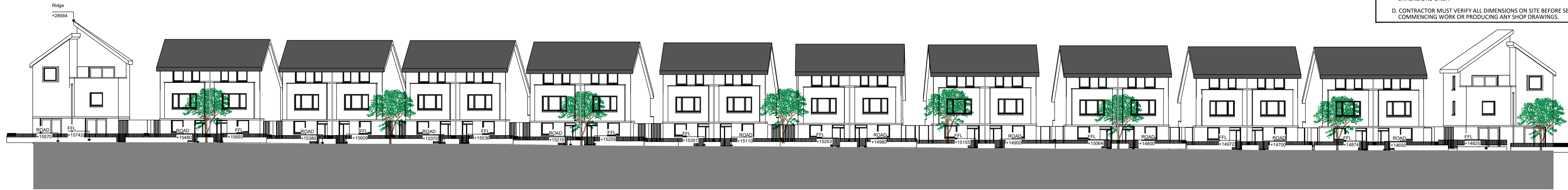
9 [Elevation AA] Not To Scale

GENERAL NOTES: A. THIS DRAWING TO BE READ IN CONJUNCTION WITH ALL RELEVANT ARCHITECTURAL DRAWINGS THE SPECIFICATION AND ALL RELEVANT STANDARD DETAIL DRAWINGS. B. THIS DRAWING TO BE READ IN CONJUNCTION WITH ALL RELEVANT CIVIL, STRUCTURAL, MECHANICAL AND ELECTRICAL DRAWINGS TOGETHER WITH THE SPECIFICATIONS AND SCHEDULES. C. ALL DIMENSIONS IN MILLIMETERS. DO NOT SCALE FROM THIS DRAWING. USE FIGURED DIMENSIONS ONLY. D. CONTRACTOR MUST VERIFY ALL DIMENSIONS ON SITE BEFORE SETTING OUT COMMENCING WORK OR PRODUCING ANY SHOP DRAWINGS.