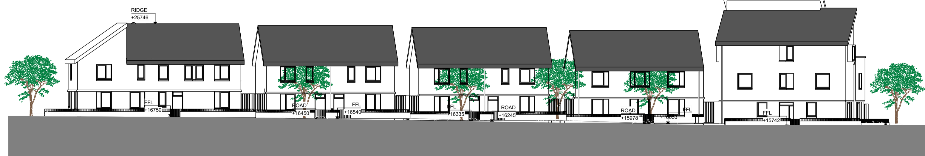
9 [Elevation DD] Not To Scale