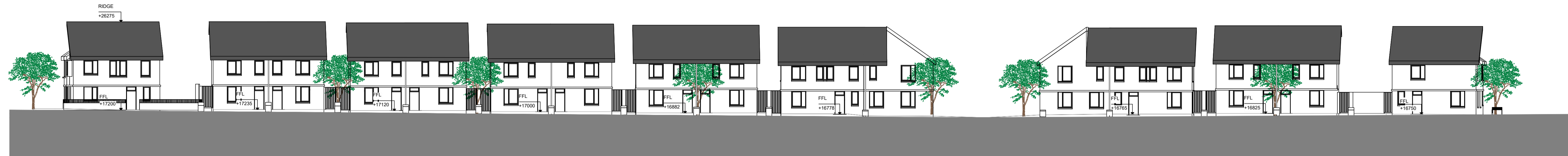
9 [Elevation BB] Not To Scale