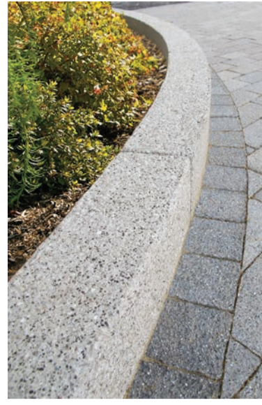
PCC kerbs with granite aggregate