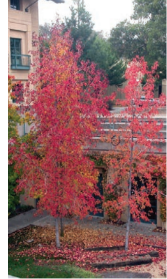
Homezone Tree 2 - Liquidambar orientalis