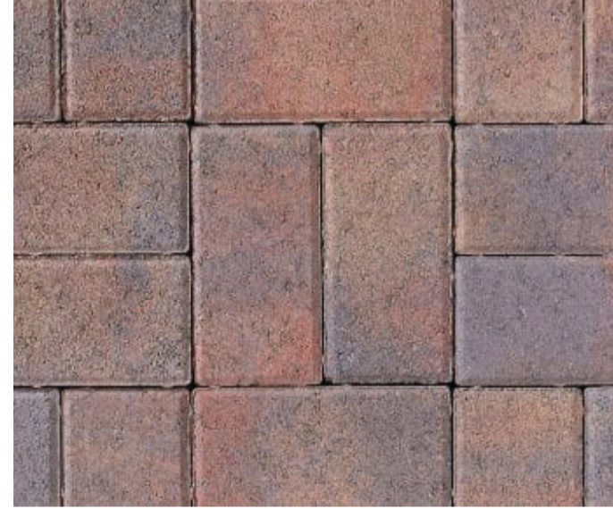
PCC bracken coloured paving blocks and matching kerbs to public parking spaces