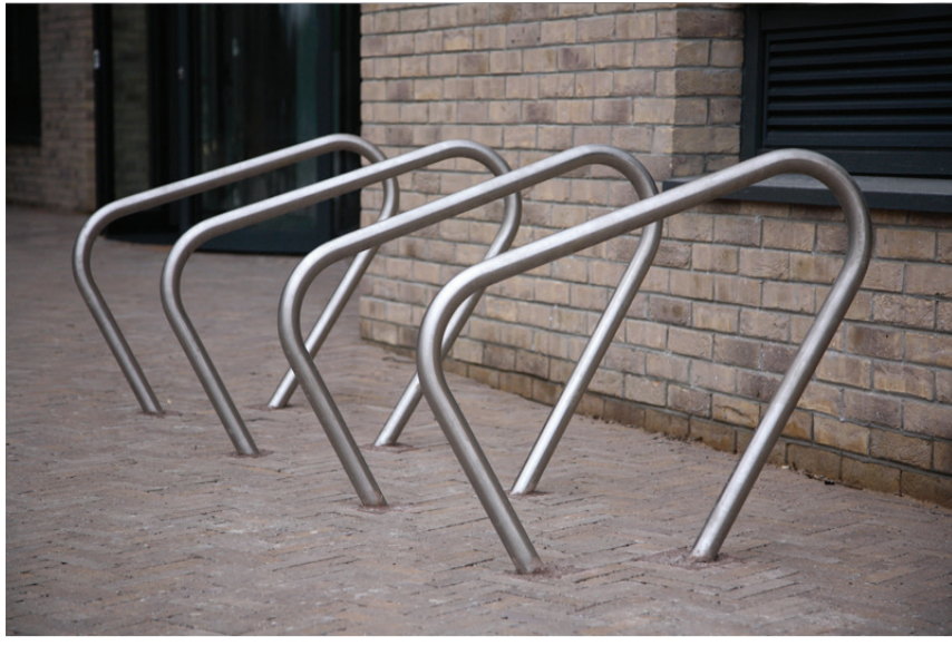
Stainless steel contemporary bicycle racks