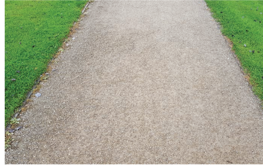
Self binding Ballylusk gravel to informal greenspace paths