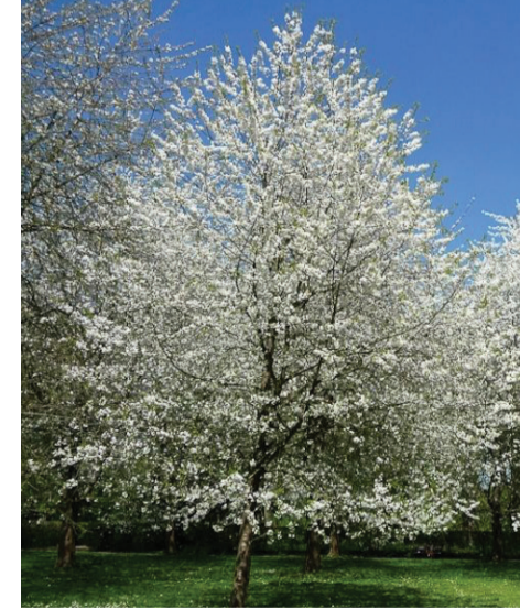
Park Tree - Prunus avium Plena