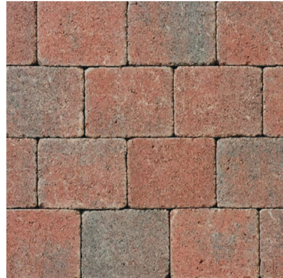
PCC pedestrian block paving to area of no vehicular access