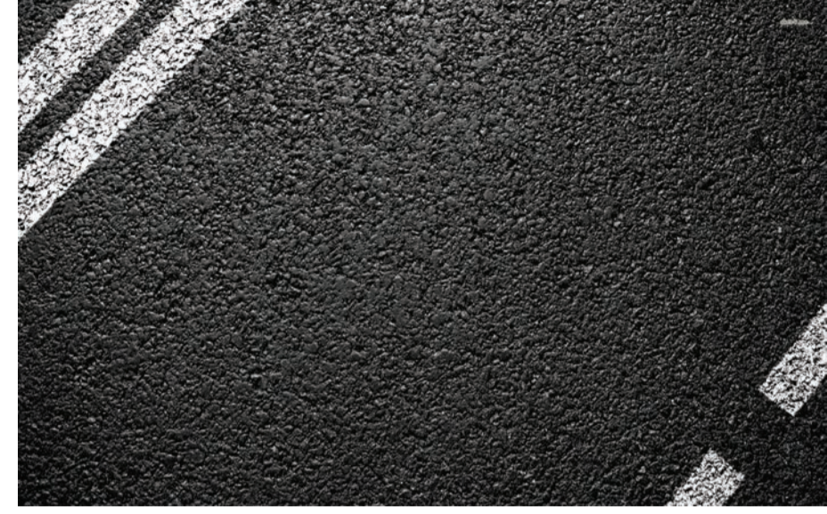
Standard asphalt for road surface