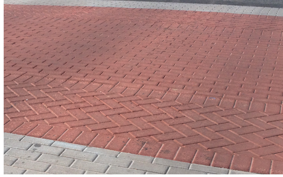
Imprinted asphalt to raised tables