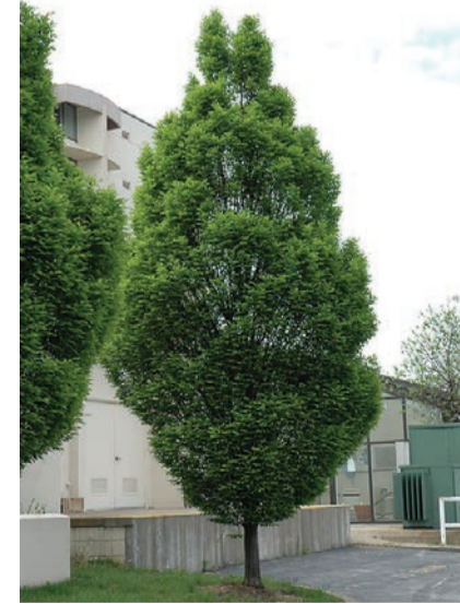
Street Tree 1 - Carpinus betulus 'Fastigiata'