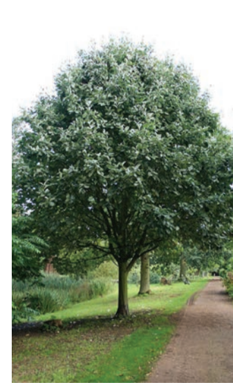
A2 Boundary Tree - Sorbus aria