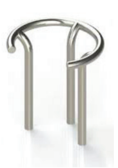
Lighting column protection for lamp posts in shared surface spaces