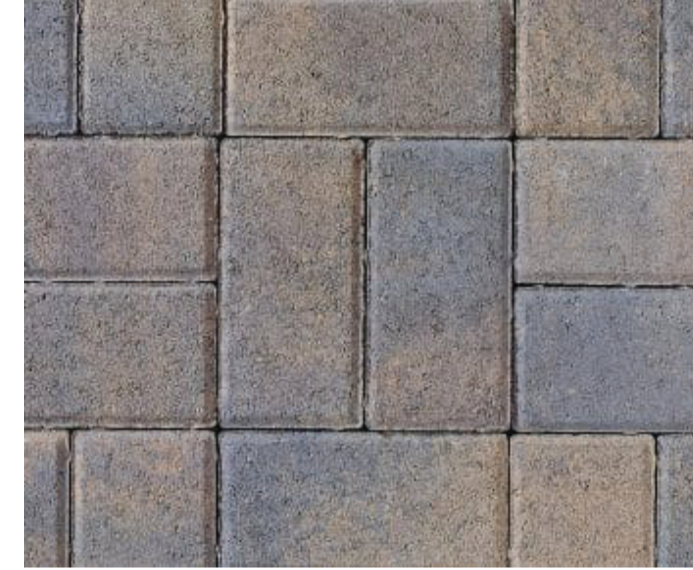
PCC heather coloured paving blocks and matching kerbs to curtilage parking spaces