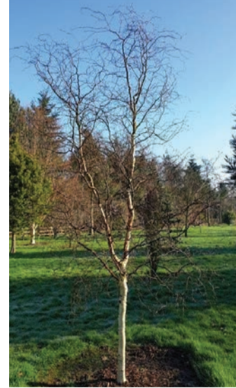
Homezone Tree 1 - Betula pendula 'Spider Alley'