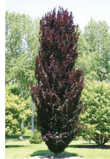
Feature Tree - Fagus sylvatica 'Dawyck Purple'