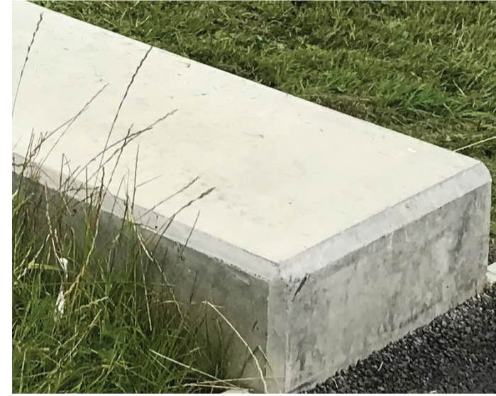
Fair faced concrete walls