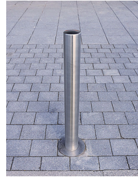
Stainless steel bollards