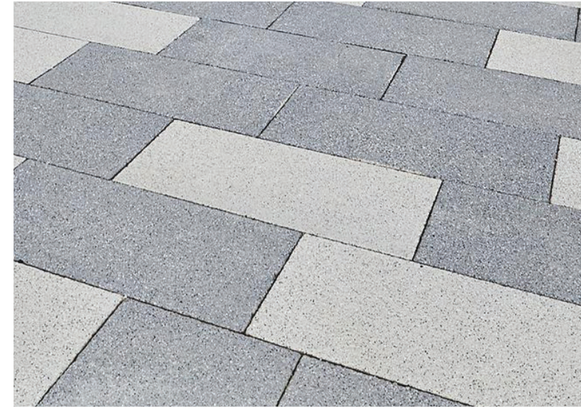
PCC slabs with granite aggregate