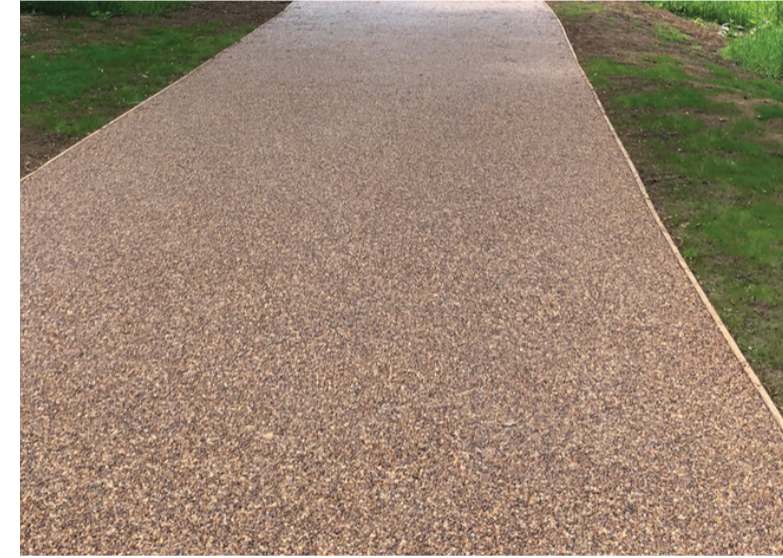
Resin bound paving to formalised greenspace paths