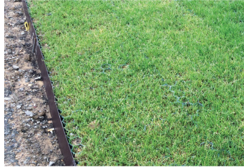
Reinforced grass to facilitate infrequent vehicular overrun