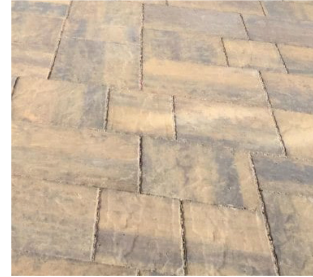
PCC historic style paving flags