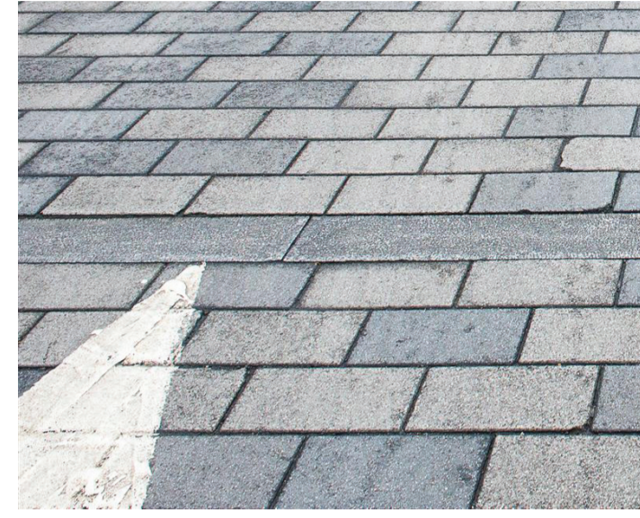
PCC paving slabs (to match Link Street crossings) at crossing locations around Main Square