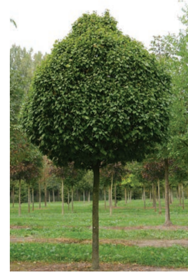
Street Tree 2 - Carpinus betulus 'Columnaris'