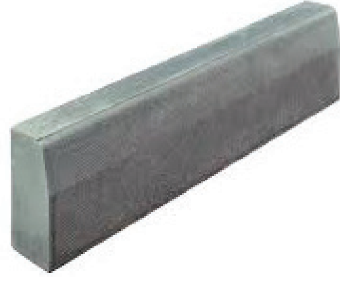
PCC half battered kerb