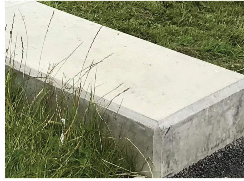
Fair faced concrete walls