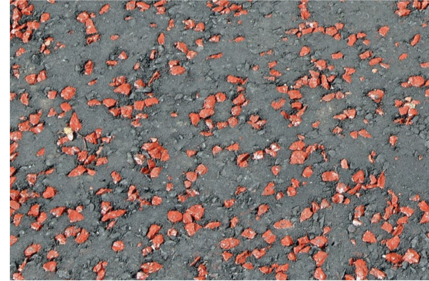
Red coloured chip asphalt to shared surface roadways