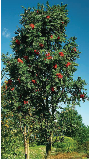
Homezone Tree 3 - Sorbus aucuparia 'Fastigiata'

GENERAL NOTES: 1. Do not scale this drawing. 2. This drawing to be read in conjunction with all other relevant drawings.