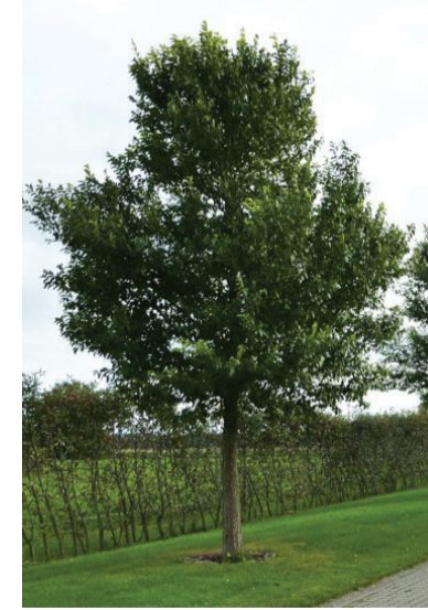
Public Square Tree - Tilia cordata 'Greenspire'