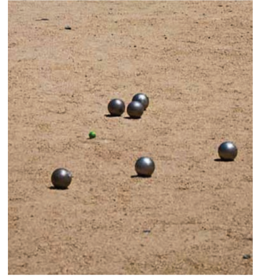
Self binding gravel petanque piste