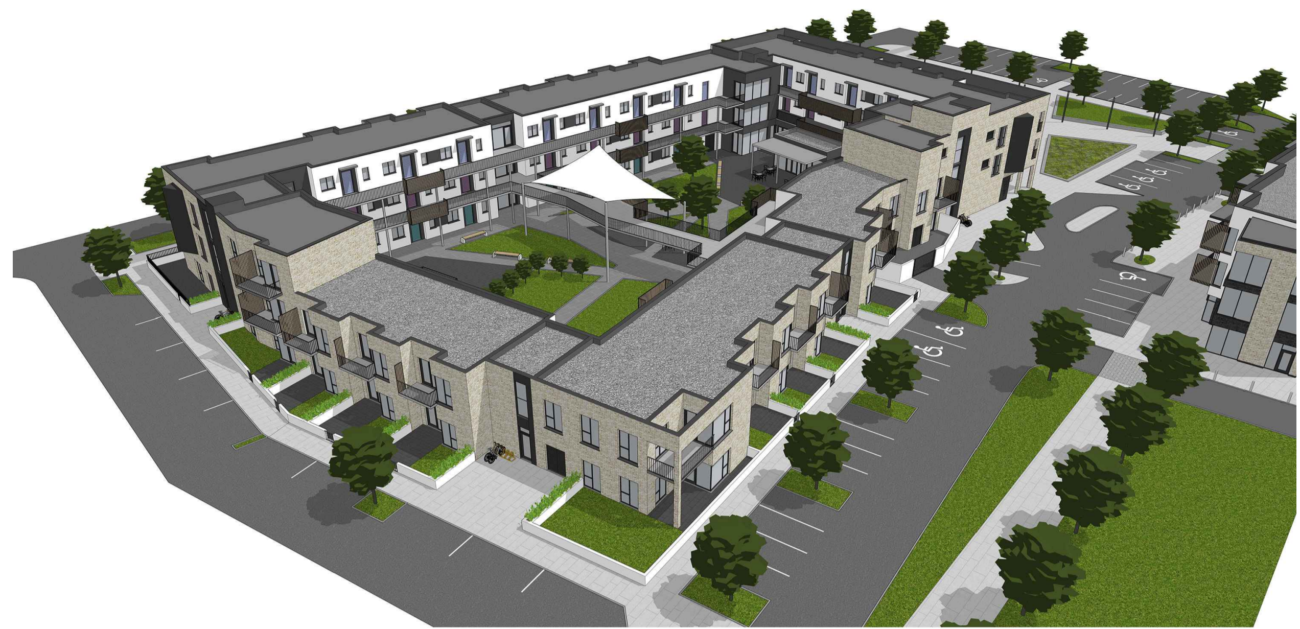
2 3D IMAGE 3 - NORTH EAST VIEW 1602 / n.t.s.