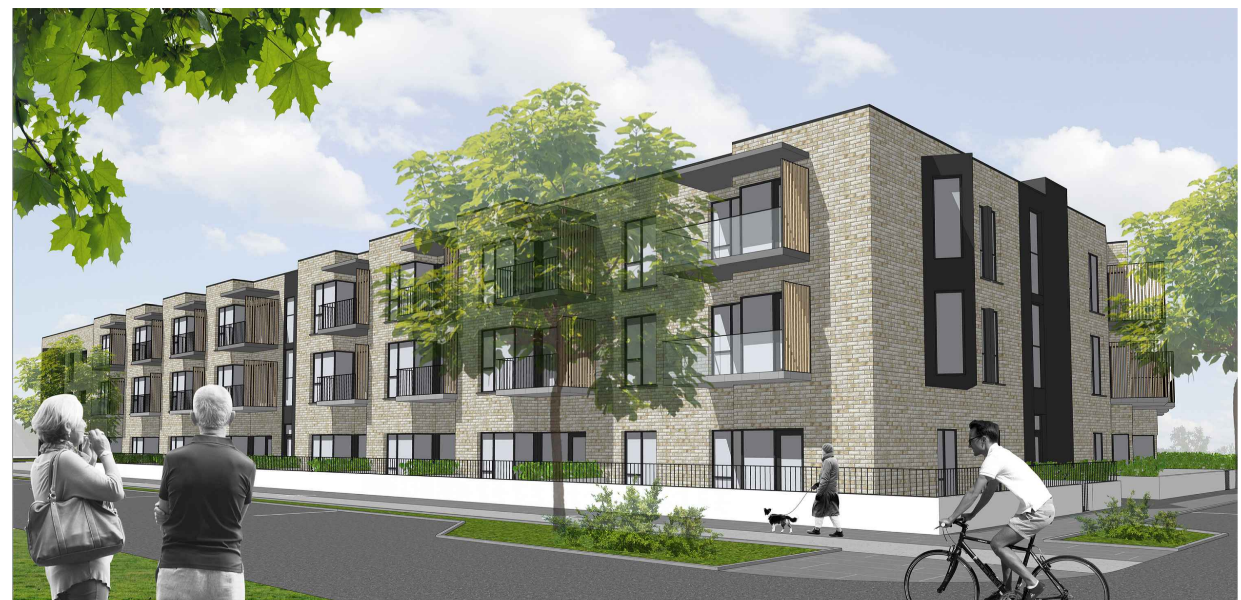
4 3D IMAGE 5 - SOUTH EAST VIEW 1602 / n.t.s.