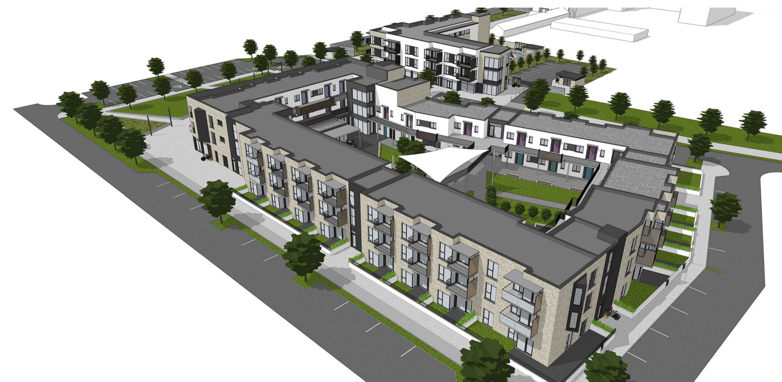
3 3D IMAGE 4 - SOUTH EAST VIEW 1602 / n.t.s.