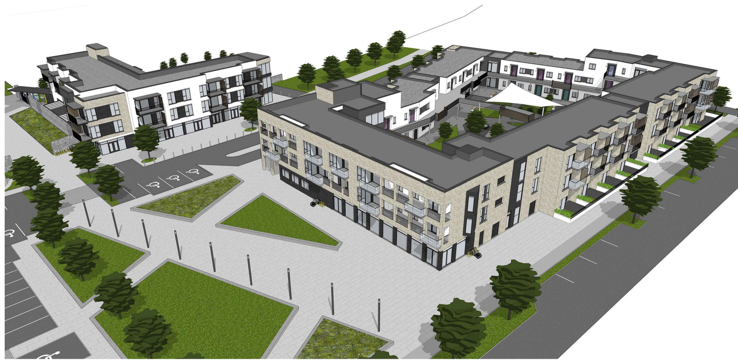
1 3D IMAGE 2 - SOUTH WEST VIEW 1602 / n.t.s.

GENERAL NOTES: A. THIS DRAWING TO BE READ IN CONJUNCTION WITH ALL RELEVANT ARCHITECTURAL DRAWINGS THE SPECIFICATION AND ALL RELEVANT STANDARD DETAIL DRAWINGS. B. THIS DRAWING TO BE READ IN CONJUNCTION WITH ALL RELEVANT CIVIL, STRUCTURAL, MECHANICAL AND ELECTRICAL DRAWINGS TOGETHER WITH THE SPECIFICATIONS AND SCHEDULES. C. ALL DIMENSIONS IN MILLIMETERS. DO NOT SCALE FROM THIS DRAWING. USE FIGURED DIMENSIONS ONLY. D. CONTRACTOR MUST VERIFY ALL DIMENSIONS ON SITE BEFORE SETTING OUT COMMENCING WORK OR PRODUCING ANY SHOP DRAWINGS.