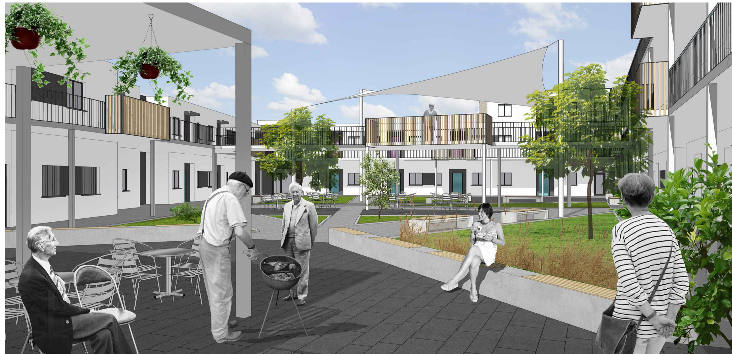
3 3D IMAGE 8 - NORTH WEST INTERNAL VIEW 1603 / n.t.s.