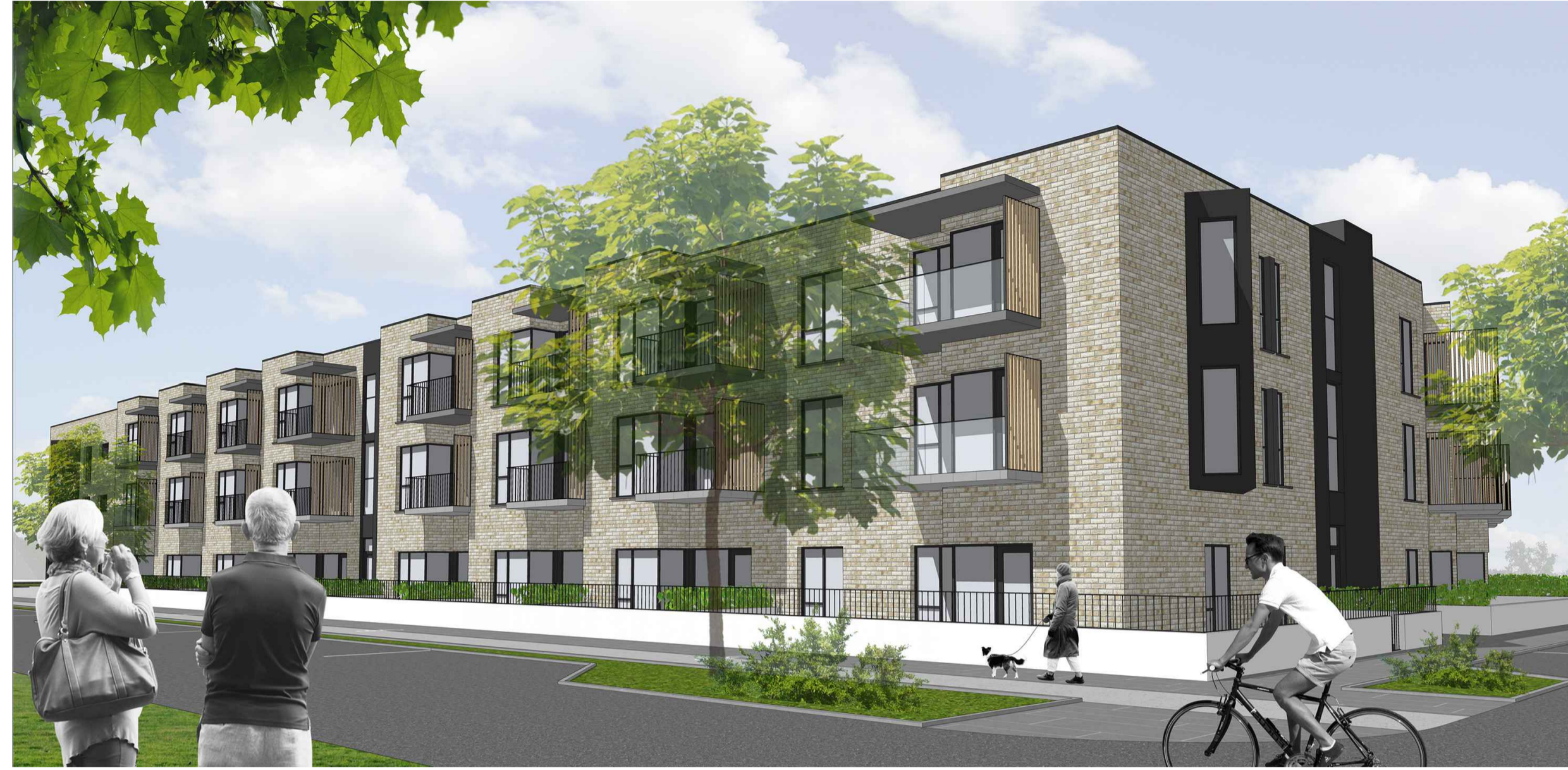
2 3D IMAGE 7 - SOUTH WEST VIEW 1603 / n.t.s.