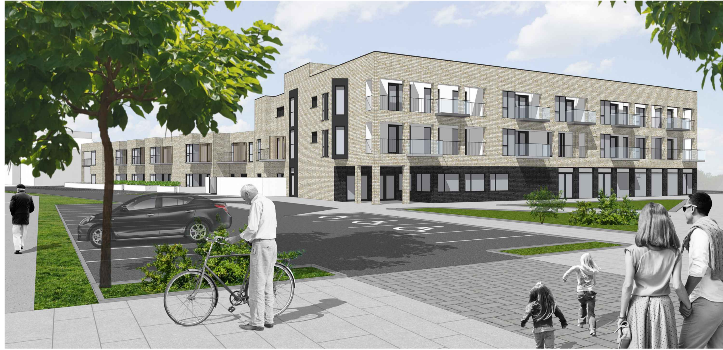
1 3D IMAGE 6 - NORTH WEST VIEW 1603 / n.t.s.

GENERAL NOTES: A. THIS DRAWING TO BE READ IN CONJUNCTION WITH ALL RELEVANT ARCHITECTURAL DRAWINGS THE SPECIFICATION AND ALL RELEVANT STANDARD DETAIL DRAWINGS. B. THIS DRAWING TO BE READ IN CONJUNCTION WITH ALL RELEVANT CIVIL, STRUCTURAL, MECHANICAL AND ELECTRICAL DRAWINGS TOGETHER WITH THE SPECIFICATIONS AND SCHEDULES. C. ALL DIMENSIONS IN MILLIMETERS. DO NOT SCALE FROM THIS DRAWING. USE FIGURED DIMENSIONS ONLY. D. CONTRACTOR MUST VERIFY ALL DIMENSIONS ON SITE BEFORE SETTING OUT COMMENCING WORK OR PRODUCING ANY SHOP DRAWINGS.