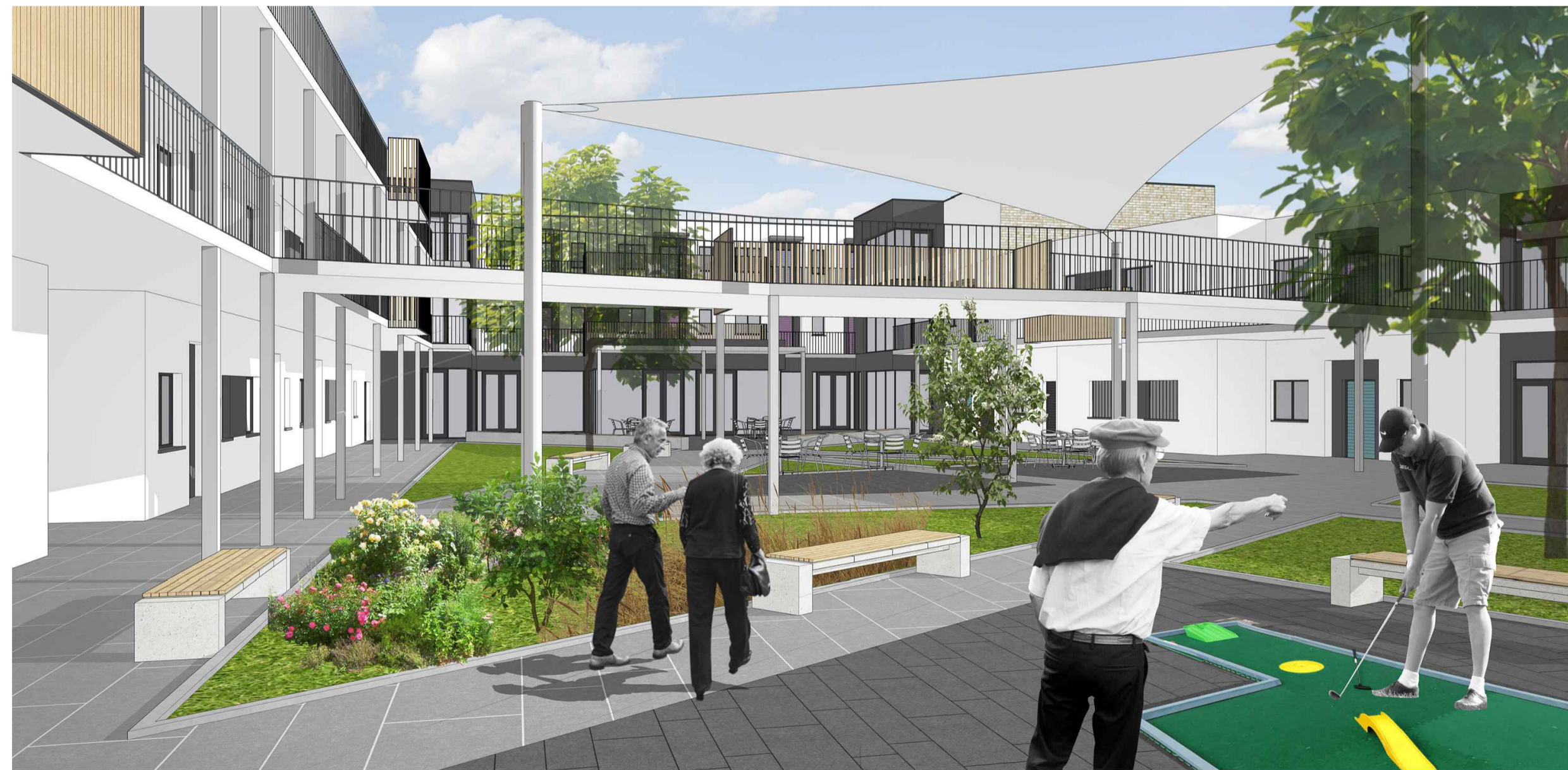
4 3D IMAGE 9 - SOUTH EAST INTERNAL VIEW 1603 / n.t.s.