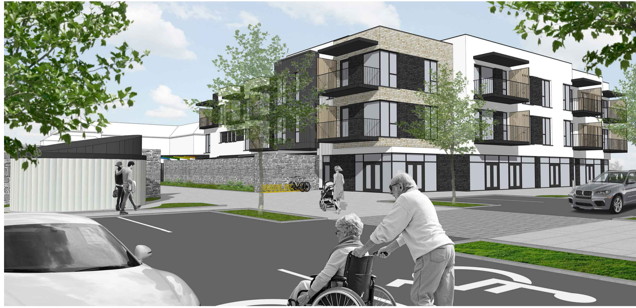
1 3D IMAGE 13 - SOUTH WEST VIEW - CRECHE & COMMUNITY FACILITY VIEW FROM SQUARE S1 1605 / n.t.s.

GENERAL NOTES: A. THIS DRAWING TO BE READ IN CONJUNCTION WITH ALL RELEVANT ARCHITECTURAL DRAWINGS THE SPECIFICATION AND ALL RELEVANT STANDARD DETAIL DRAWINGS. B. THIS DRAWING TO BE READ IN CONJUNCTION WITH ALL RELEVANT CIVIL, STRUCTURAL, MECHANICAL AND ELECTRICAL DRAWINGS TOGETHER WITH THE SPECIFICATIONS AND SCHEDULES. C. ALL DIMENSIONS IN MILLIMETERS. DO NOT SCALE FROM THIS DRAWING. USE FIGURED DIMENSIONS ONLY. D. CONTRACTOR MUST VERIFY ALL DIMENSIONS ON SITE BEFORE SETTING OUT COMMENCING WORK OR PRODUCING ANY SHOP DRAWINGS.