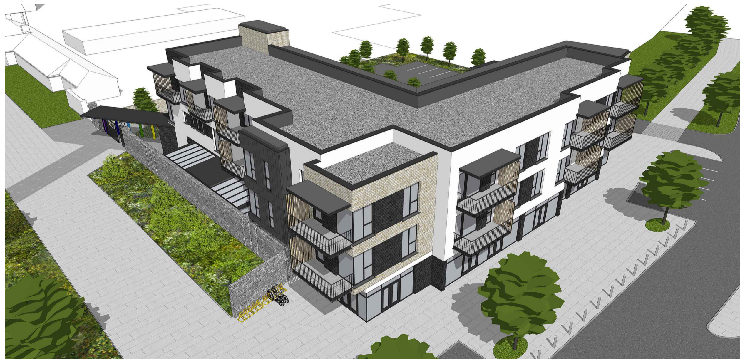
3 3D IMAGE 15 - SOUTH EAST VIEW - CRECHE & COMMUNITY FACILITY 1605 / n.t.s.