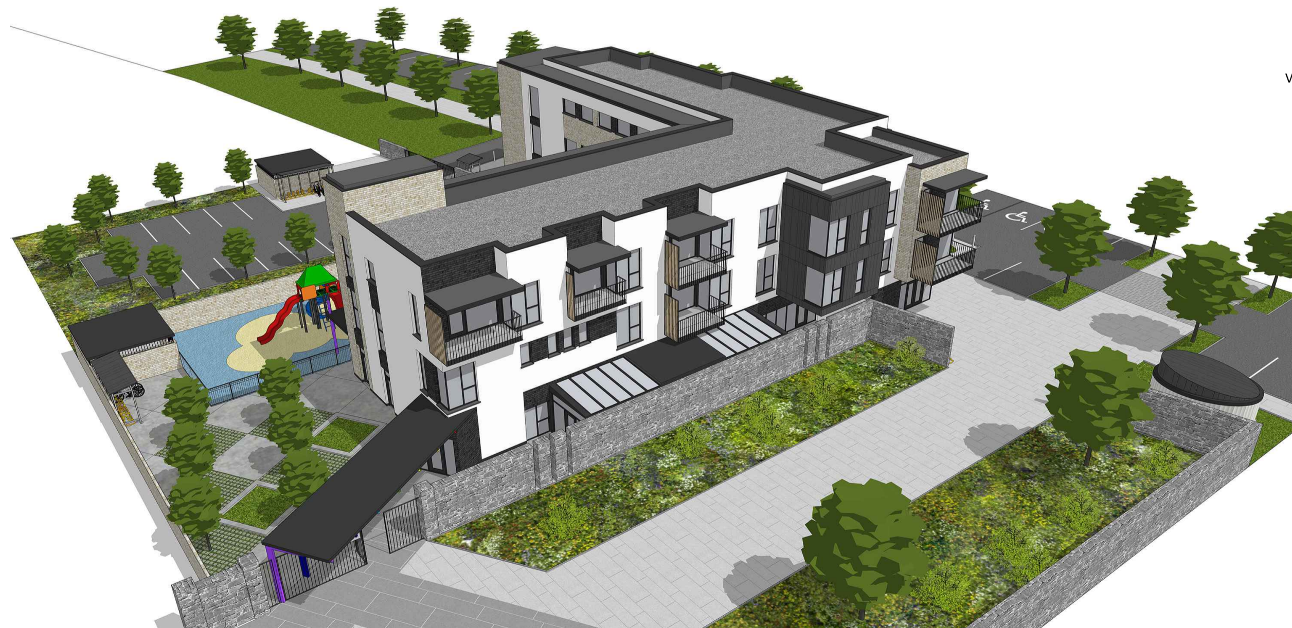
4 3D IMAGE 16 - WEST VIEW OF CRECHE 1605 / n.t.s.