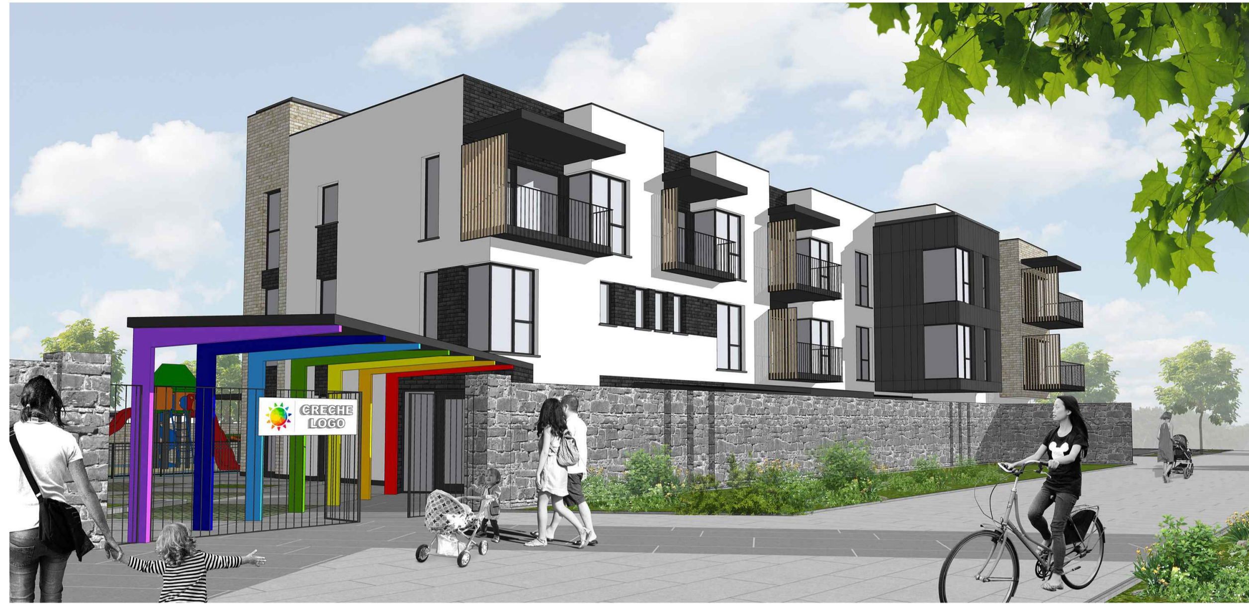
2 3D IMAGE 14 - WEST VIEW CRECHE ENTRANCE 1605 / n.t.s.