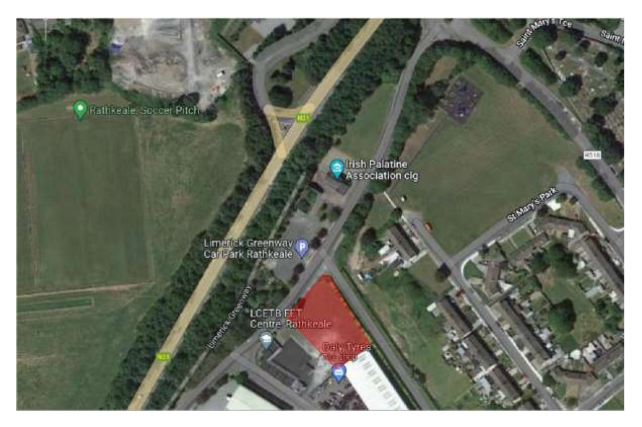
Figure 1.1 Proposed Temporary Carpark on the Rathkeale Industrial Estate Road

The overall scheme aims to provide a new pedestrian crossing on the Rathkeale Industrial estate road. This pedestrian crossing is being constructed to provide a safe link for cyclists and pedestrians from the Limerick Greenway to a temporary Greenway car par, located in the LCETB site. These works will facilitate the construction of the proposed Limerick Greenway hub @ Rathkeale.