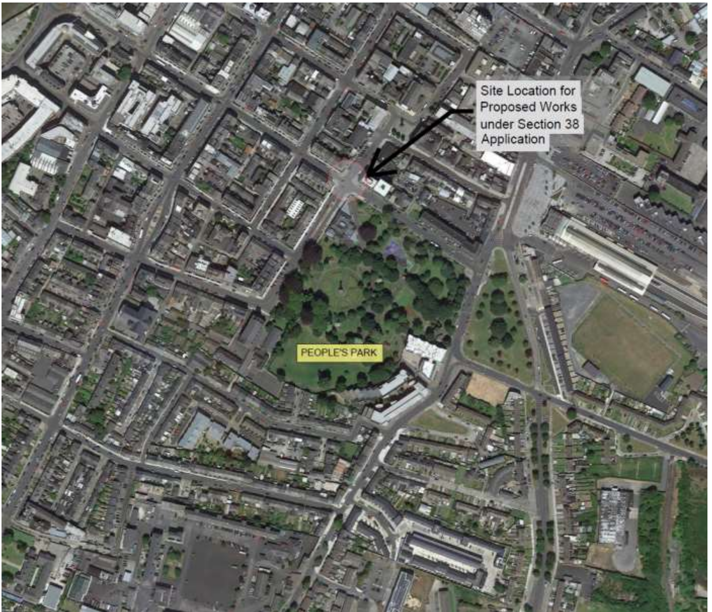
Figure 2.1: Site Location – Junction at the intersection of Mallow Street and Pery Square