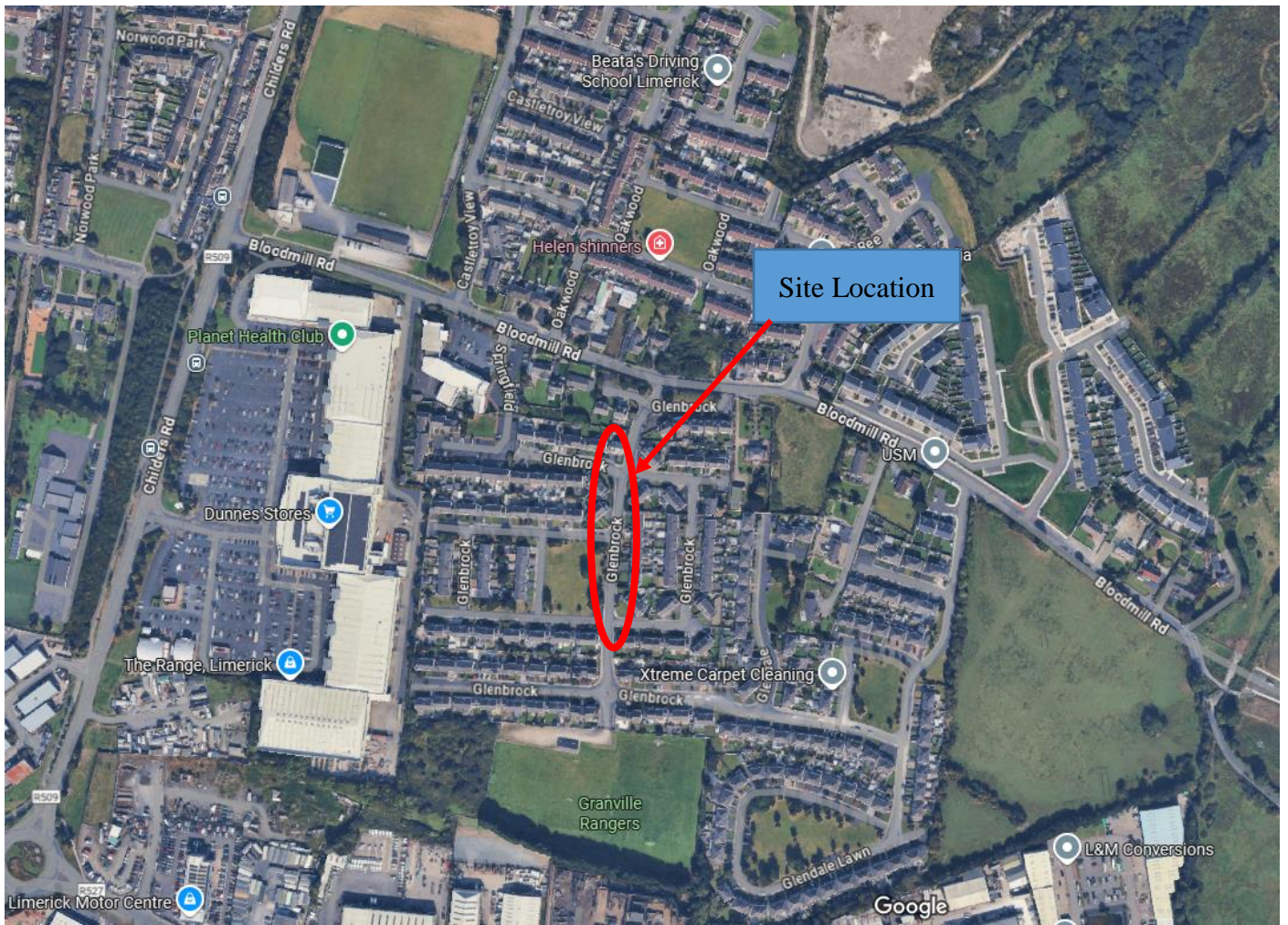
Figure 2.1: Site Location – L-10802, Glenbrook, Singland, Limerick