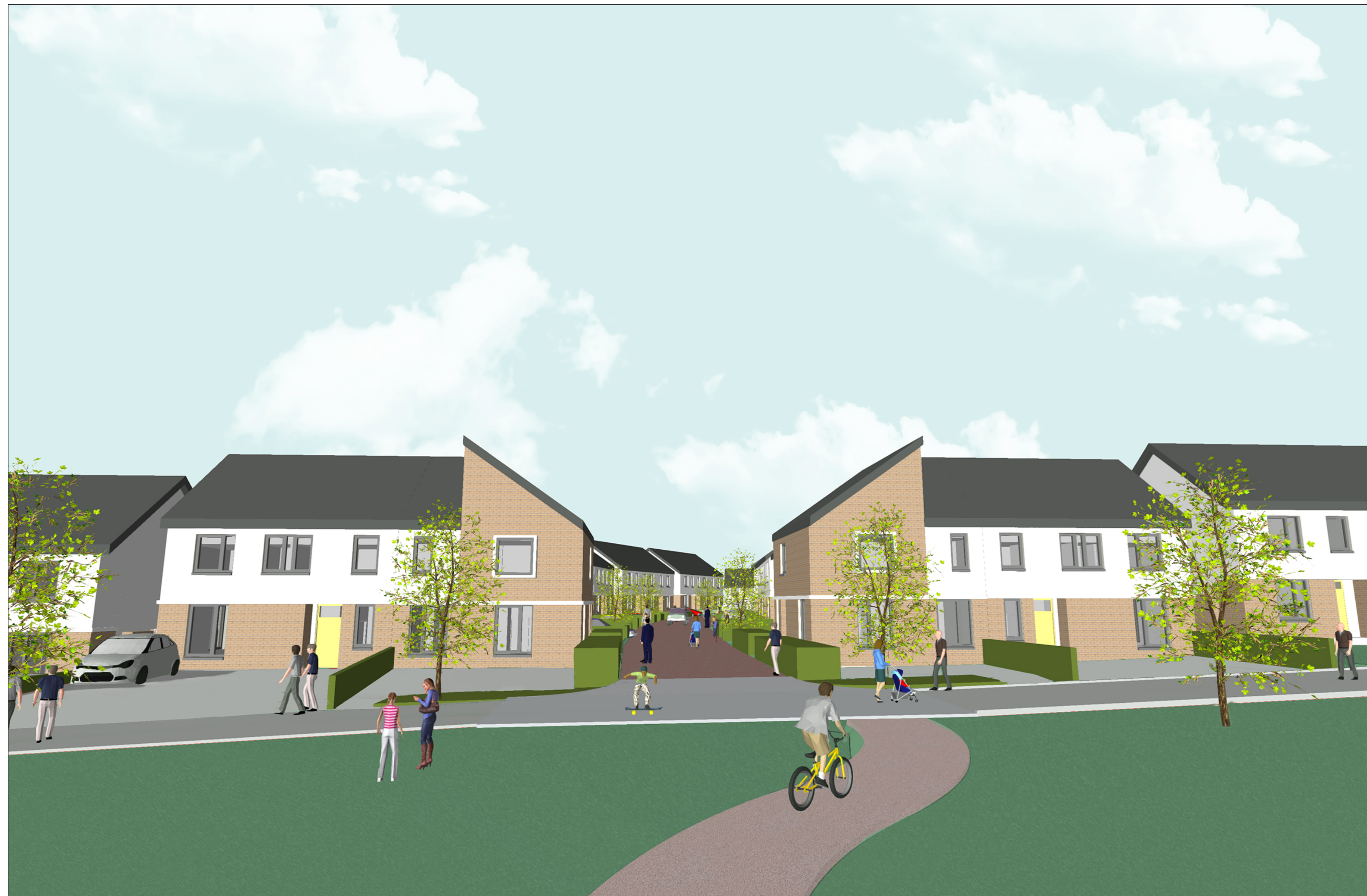
View from central square towards homezone in Area A3