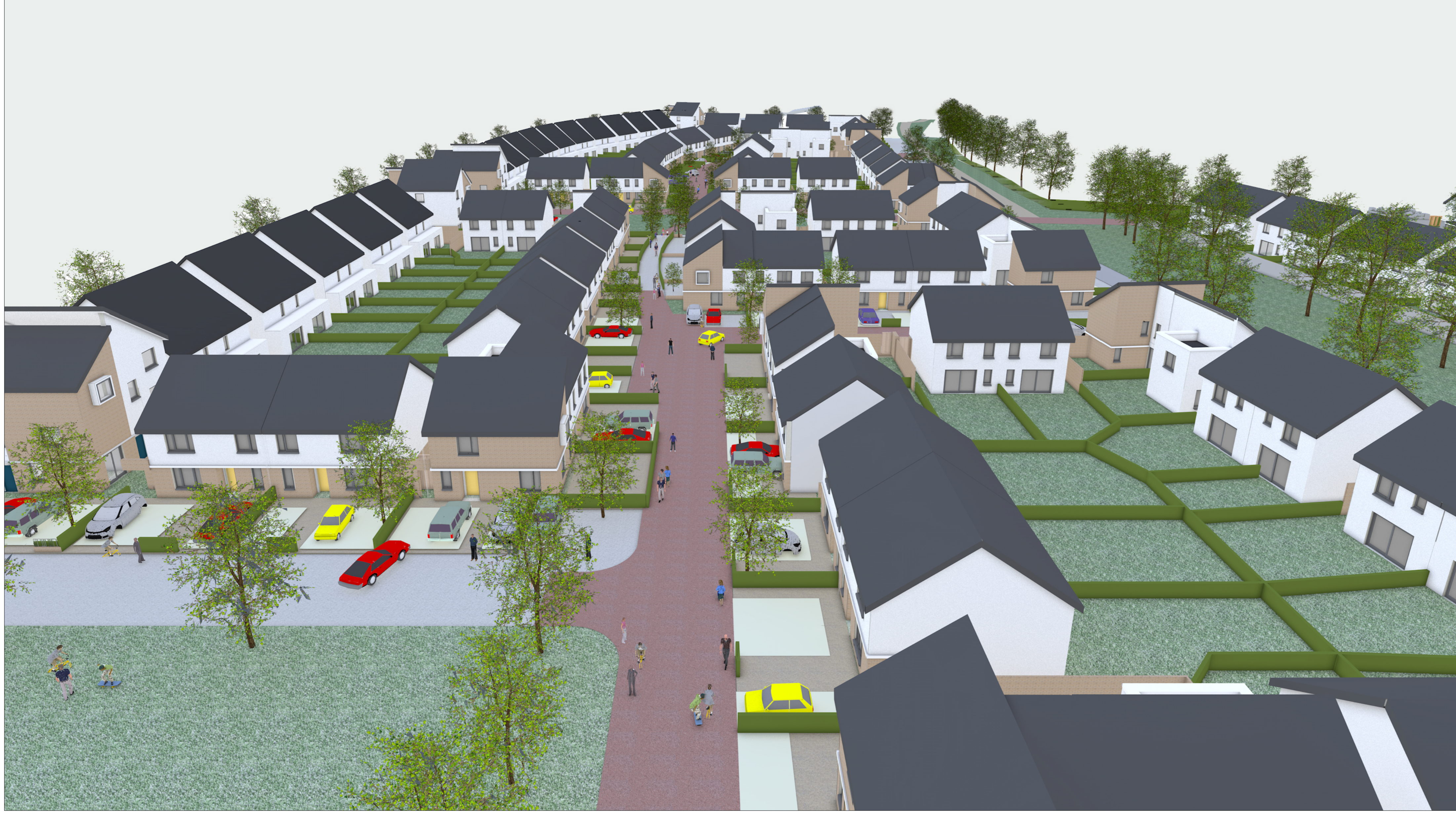
View into area A1 homezone from the east