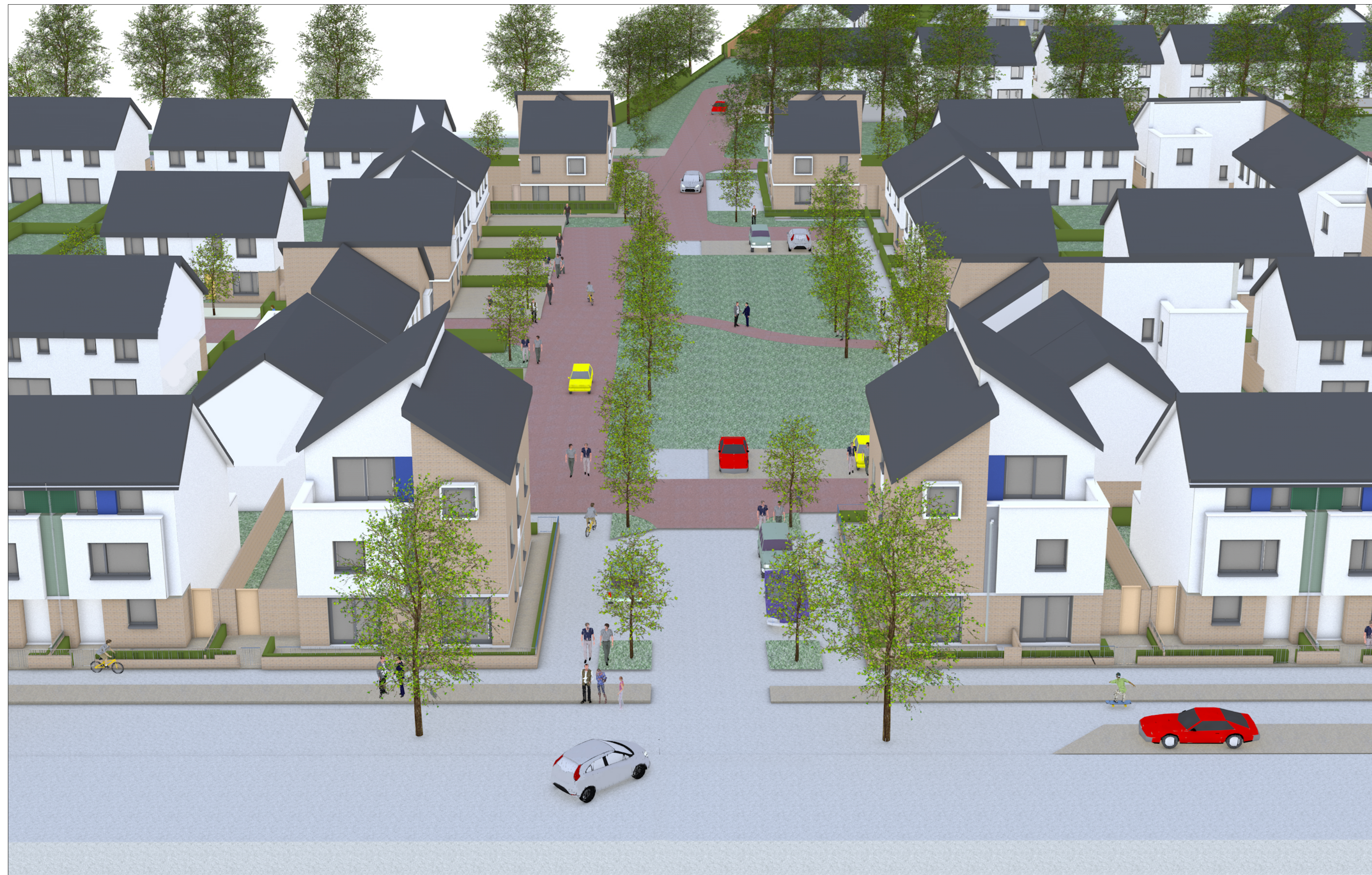
View of central square from the Link Street