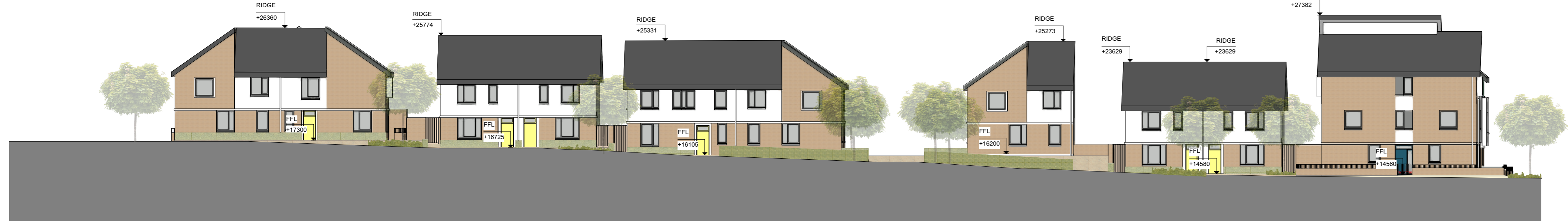
4 [Elevation DD] Scale: 1:200