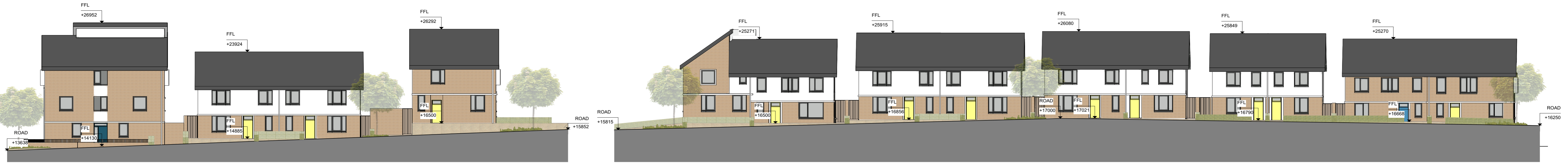
2 [Elevation BB] Scale: 1:200