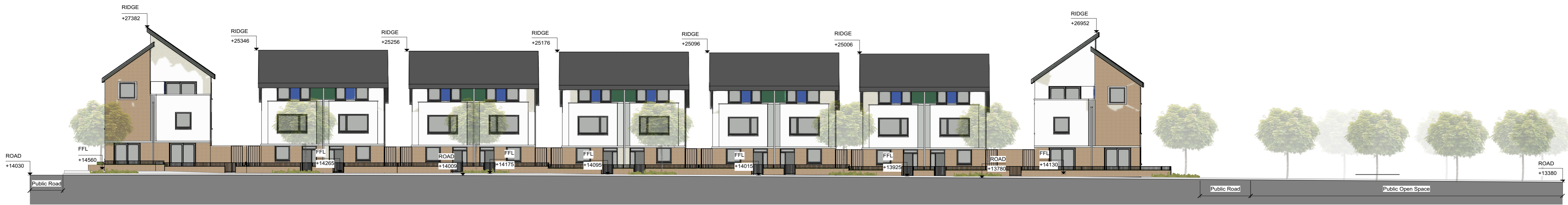
1 Elevation AA Scale: 1:200