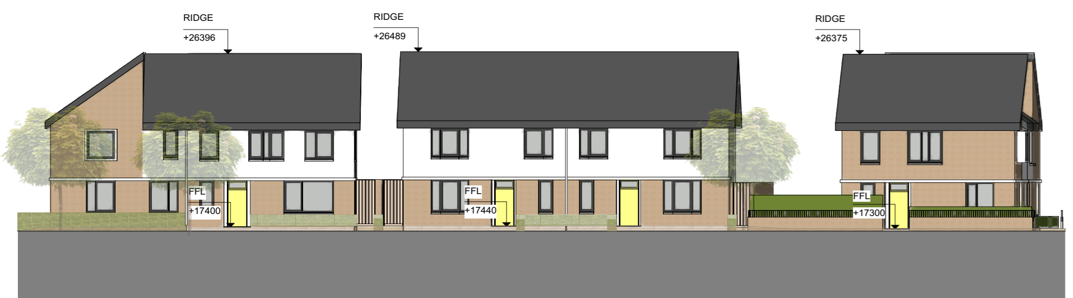
5 [Elevation EE] Scale: 1:200