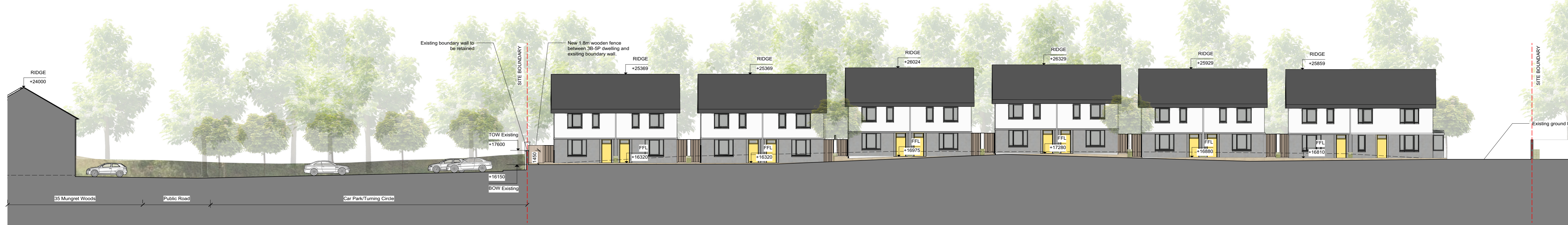
2 [Elevation AA] Scale: 1:200