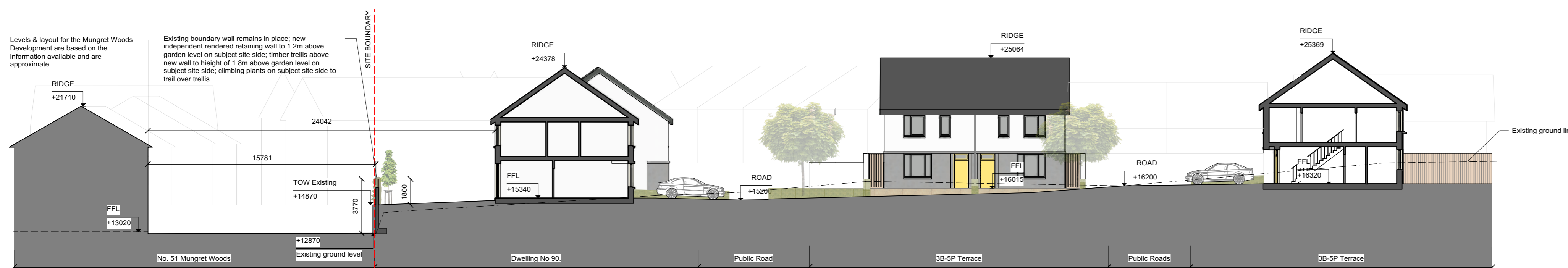
4 [Elevation B2] Scale: 1:200