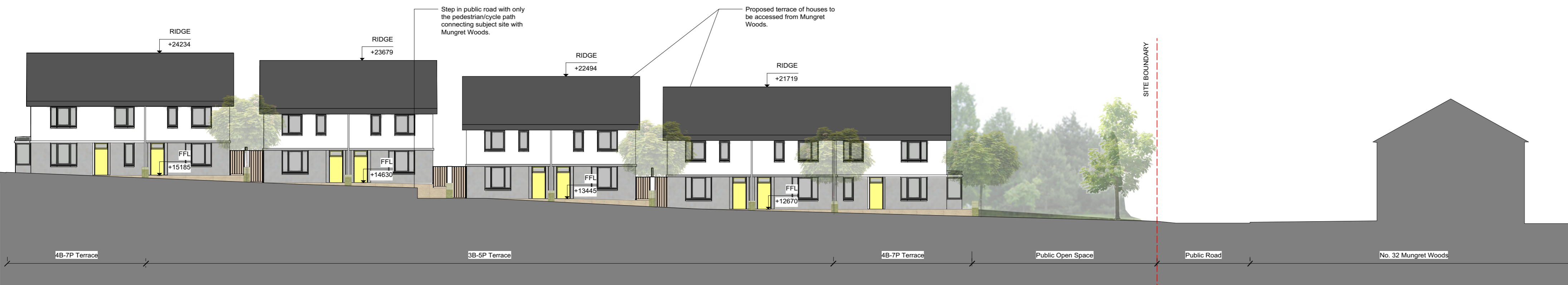
2 [Elevation DD] Scale: 1:200