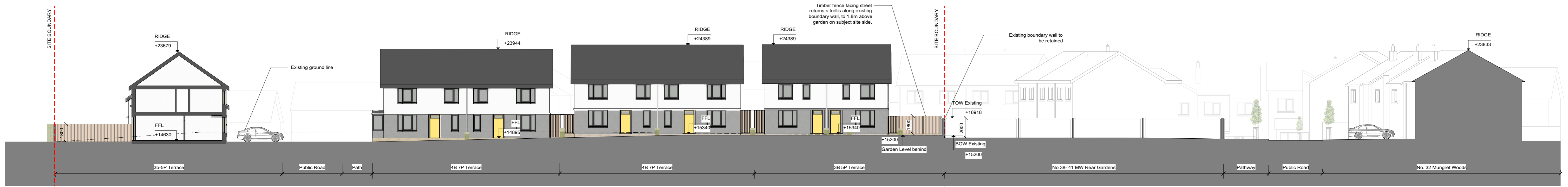
1 [Elevation CC] Scale: 1:200