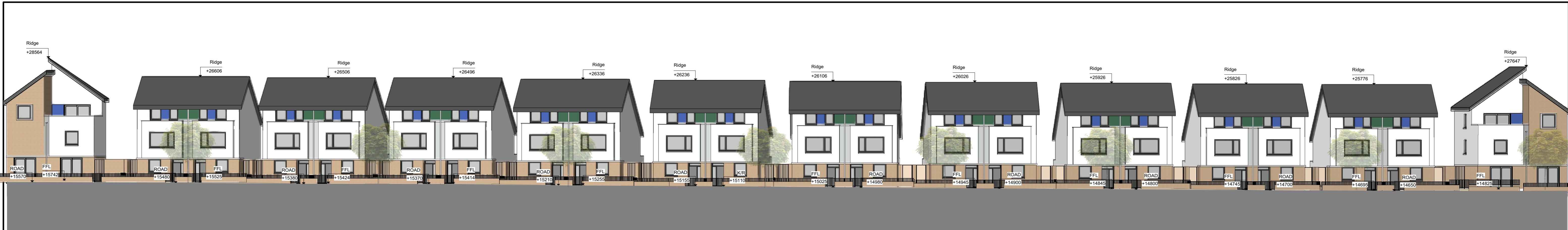
1 [Elevation AA] Scale: 1:200