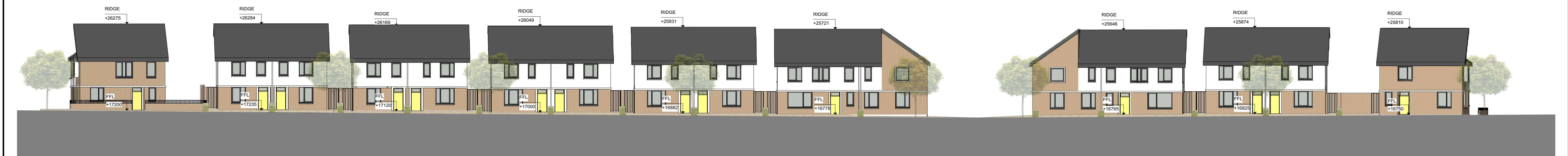
2 [Elevation BB] Scale: 1:200