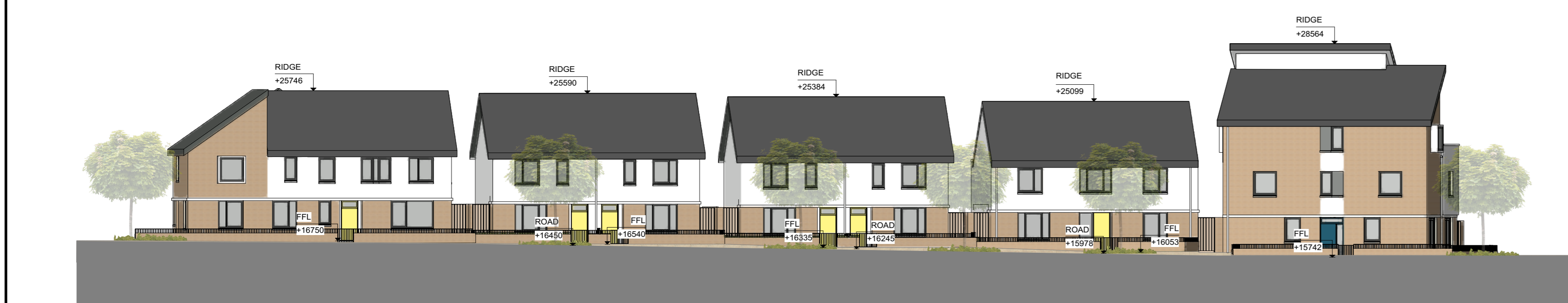
4 [Elevation DD] Scale: 1:200