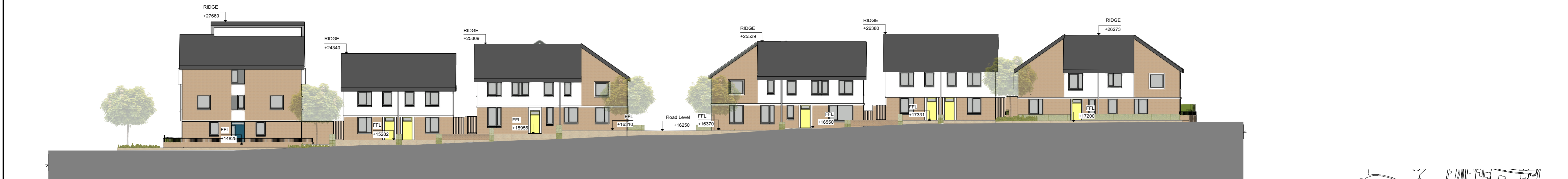
3 Elevation CC Scale: 1:200