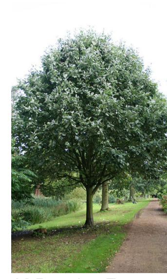
A2 Boundary Tree - Sorbus aria