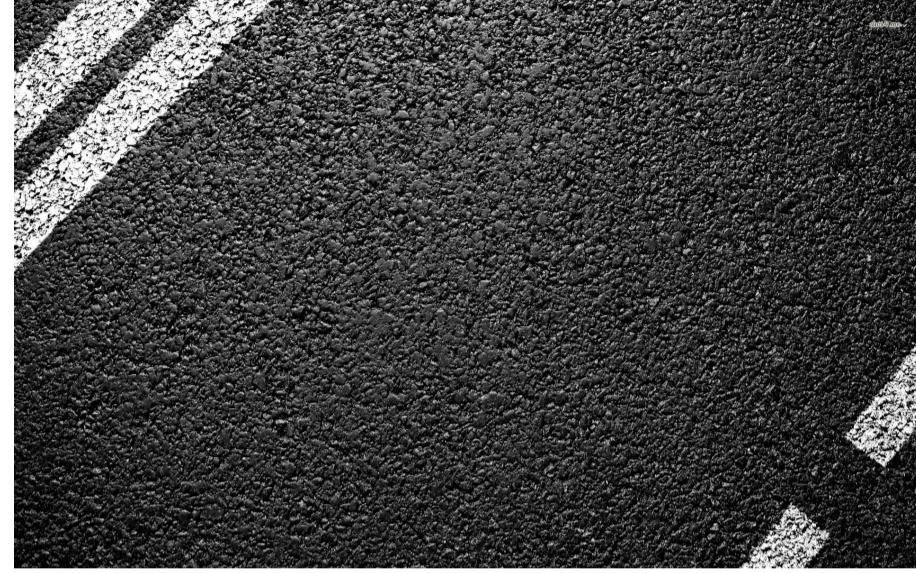
Standard asphalt for road surface