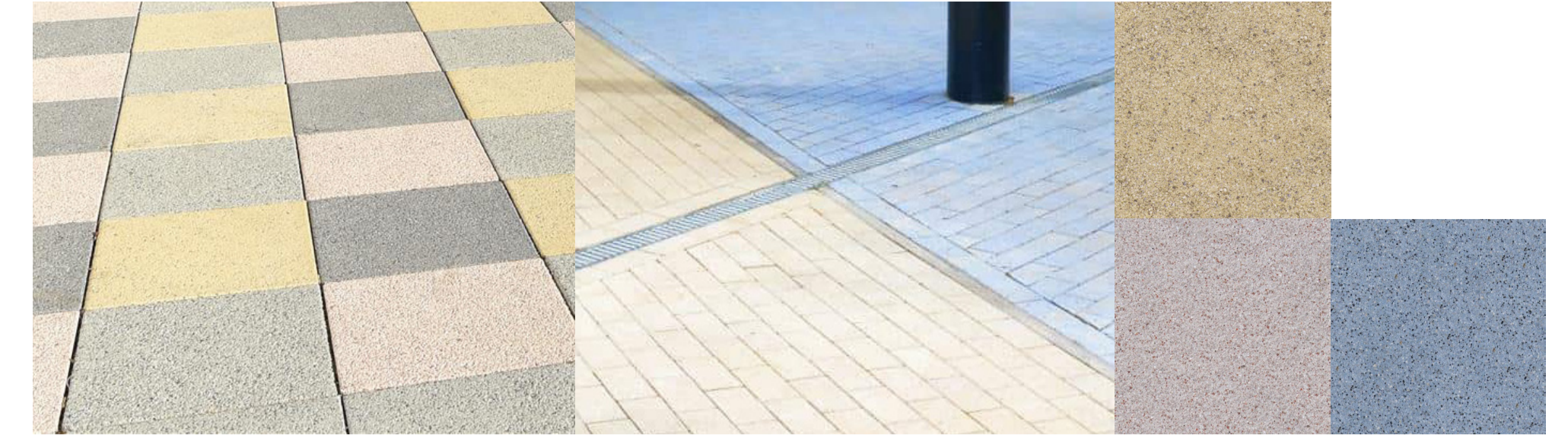
PCC slabs with granite aggregate in blue, yellow and rose