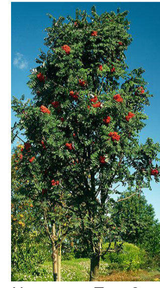
Homezone Tree 3 - Sorbus aucuparia 'Fastigiata'

GENERAL NOTES: 1. Do not scale this drawing. 2. This drawing to be read in conjunction with all other relevant drawings.