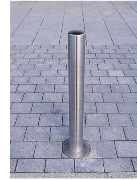
Stainless steel bollards