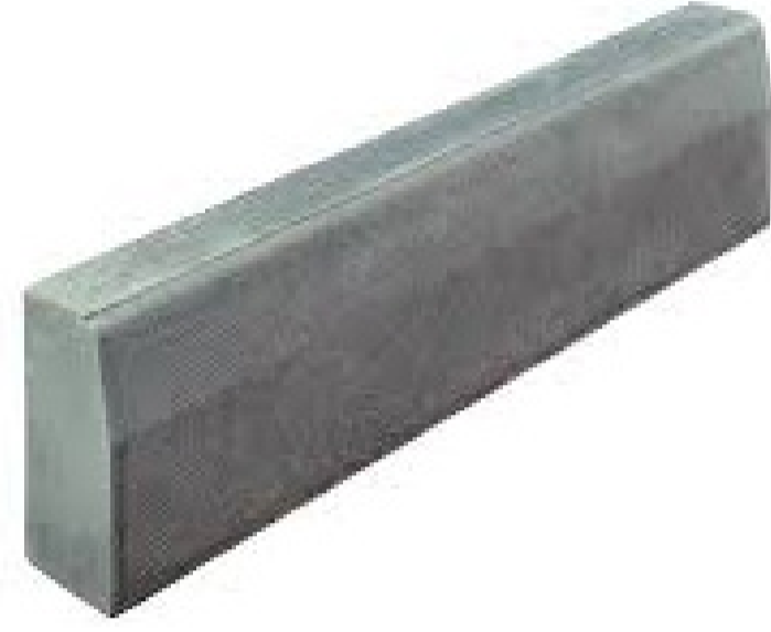
PCC half battered kerb