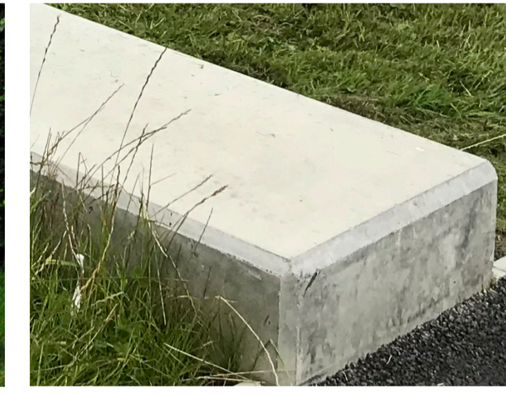
Fair faced concrete walls