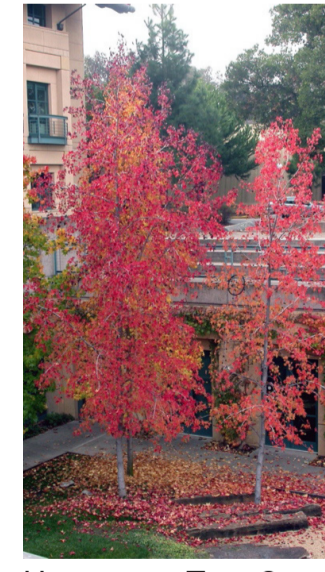
Homezone Tree 2 - Liquidambar orientalis