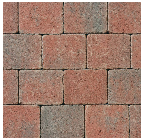
PCC pedestrian block paving to area of no vehicular access