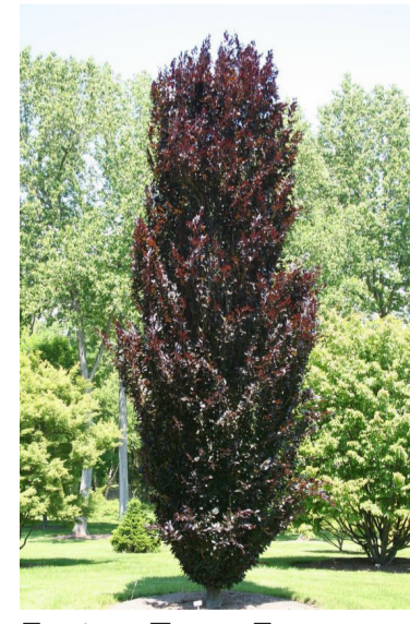
Feature Tree - Fagus sylvatica 'Dawyck Purple'