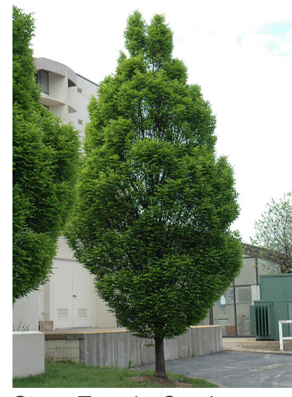
Street Tree 1 - Carpinus betulus 'Fastigiata'