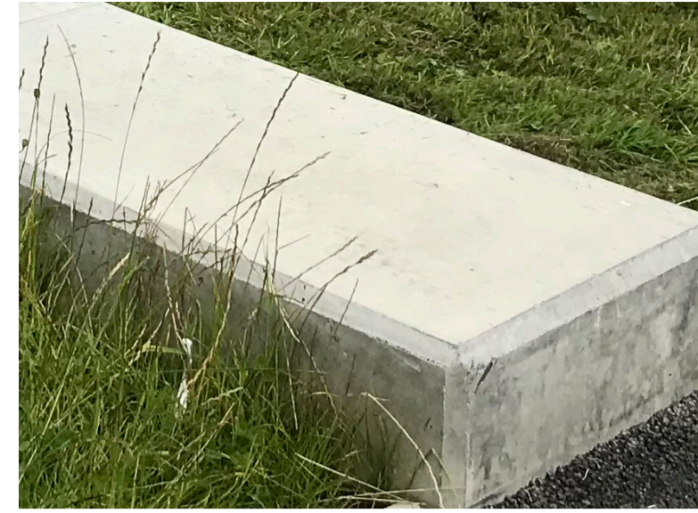
Fair faced concrete walls