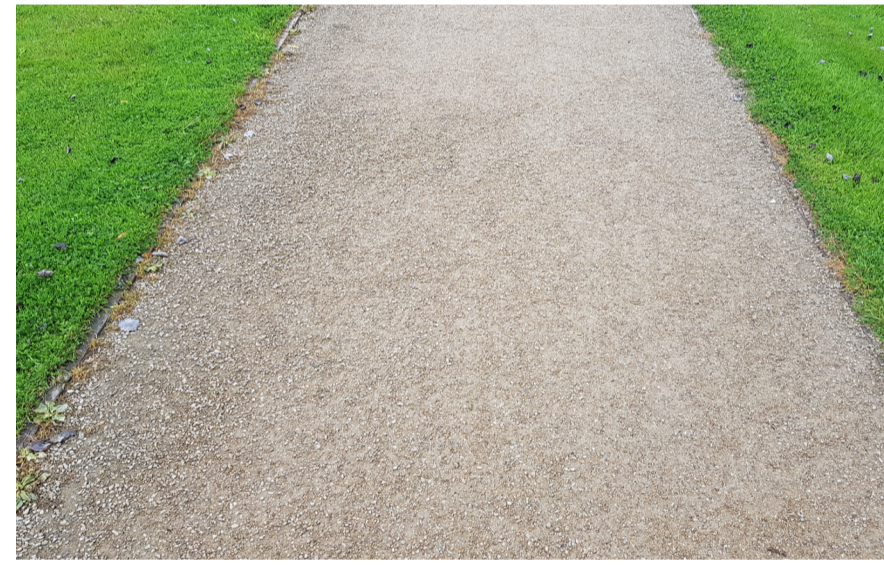
Self binding Ballylusk gravel to informal greenspace paths