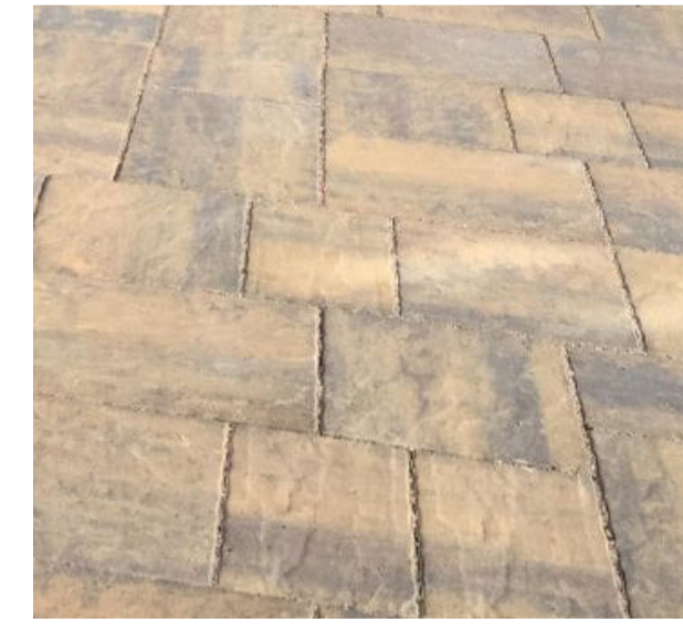
PCC historic style paving flags