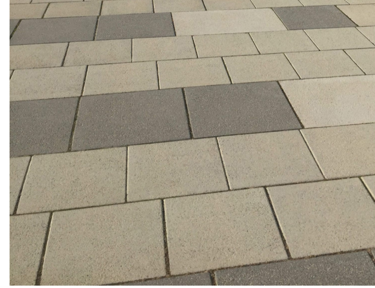
PCC textured flags to pavements