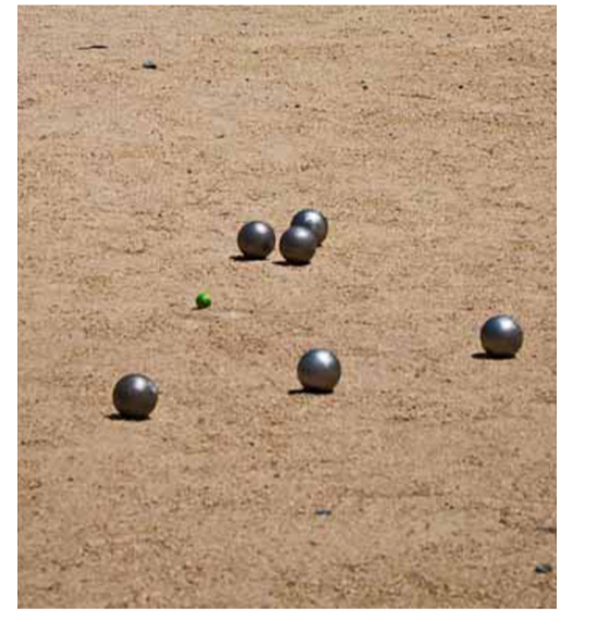
Self binding gravel petanque piste