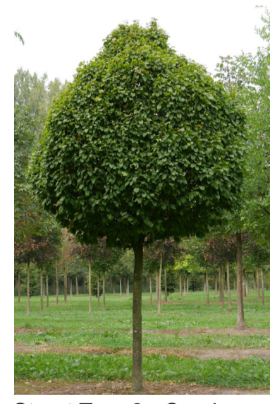
Street Tree 2 - Carpinus betulus 'Columnaris'