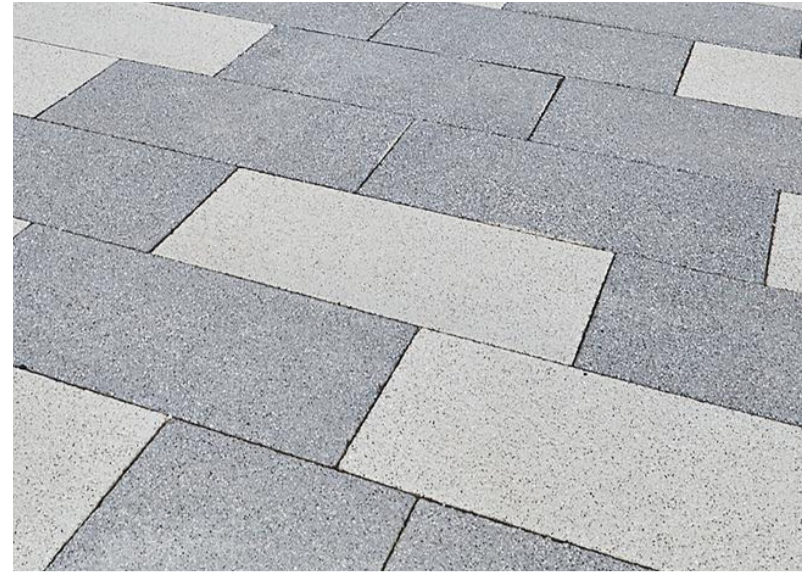
PCC slabs with granite aggregate