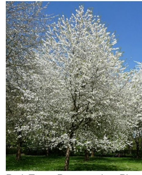
Park Tree - Prunus avium Plena