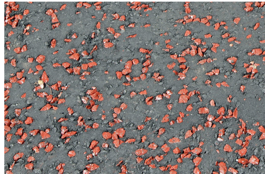
Red coloured chip asphalt to shared surface roadways