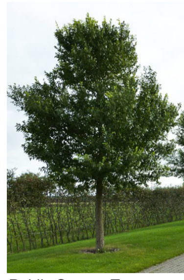
Public Square Tree - Tilia cordata 'Greenspire'