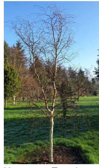
Homezone Tree 1 - Betula pendula 'Spider Alley'