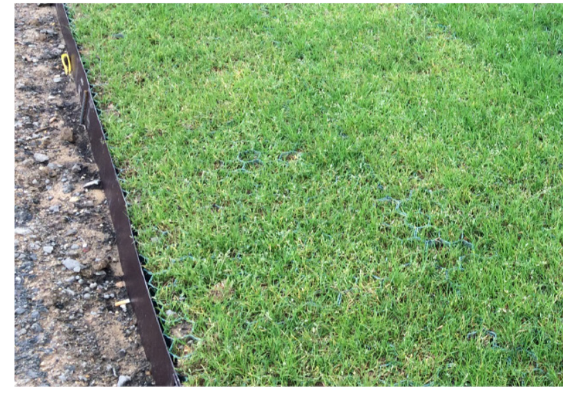
Reinforced grass to facilitate infrequent vehicular overrun