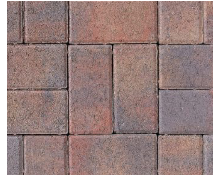
PCC bracken coloured paving blocks and matching kerbs to public parking spaces