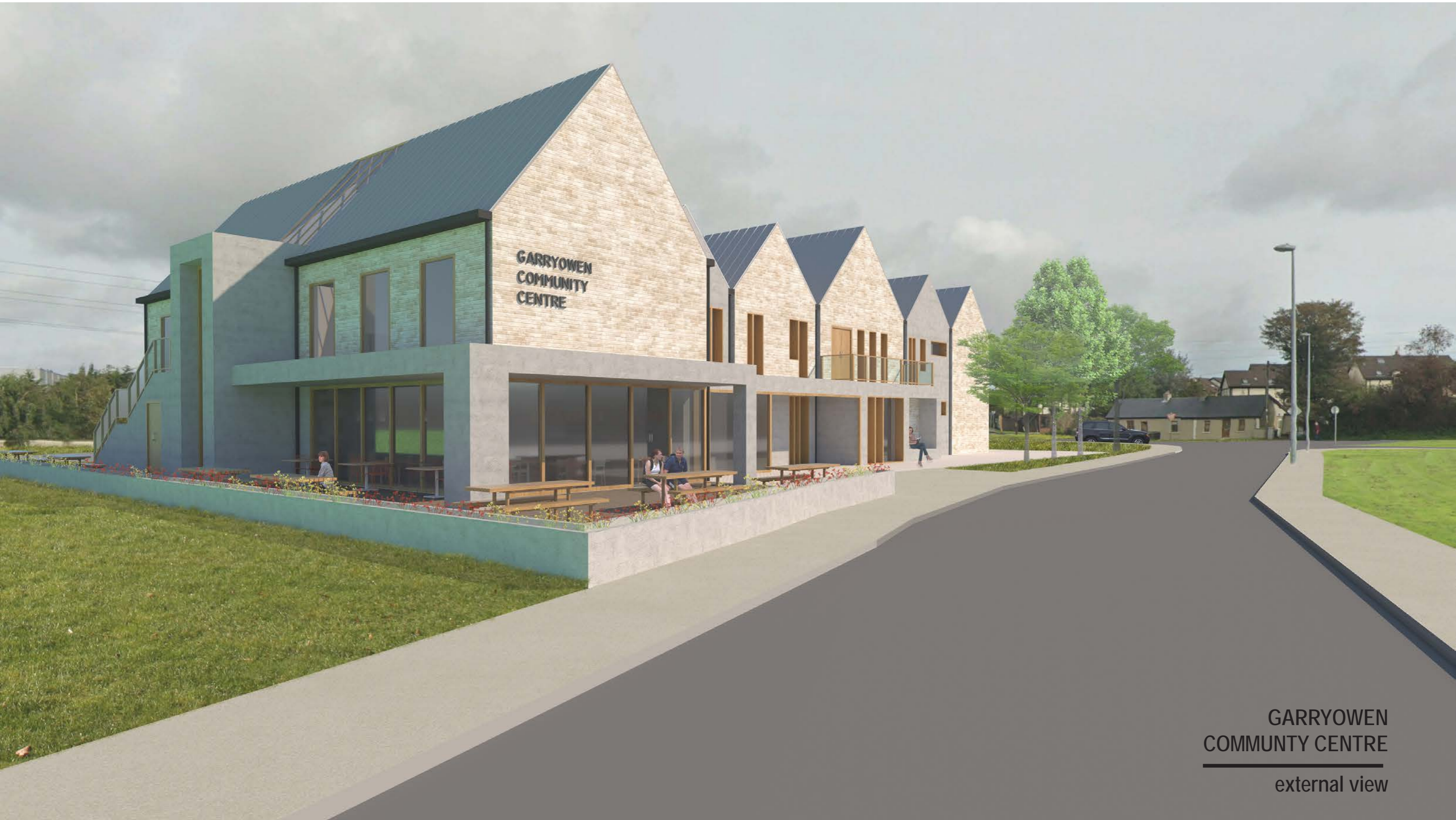
GARRYOWEN COMMUNITY CENTRE external view