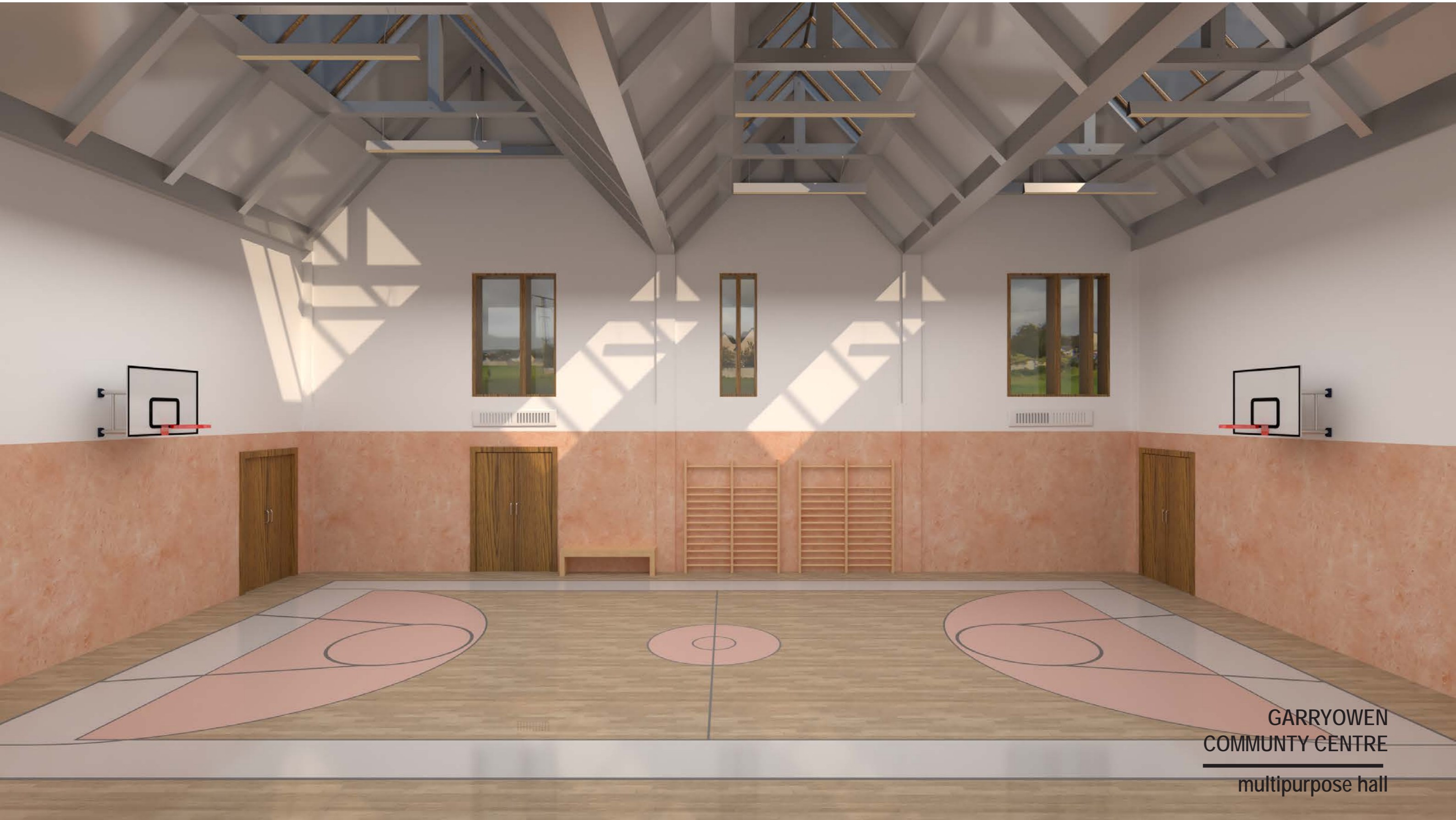
GARRYOWEN COMMUNITY CENTRE multipurpose hall