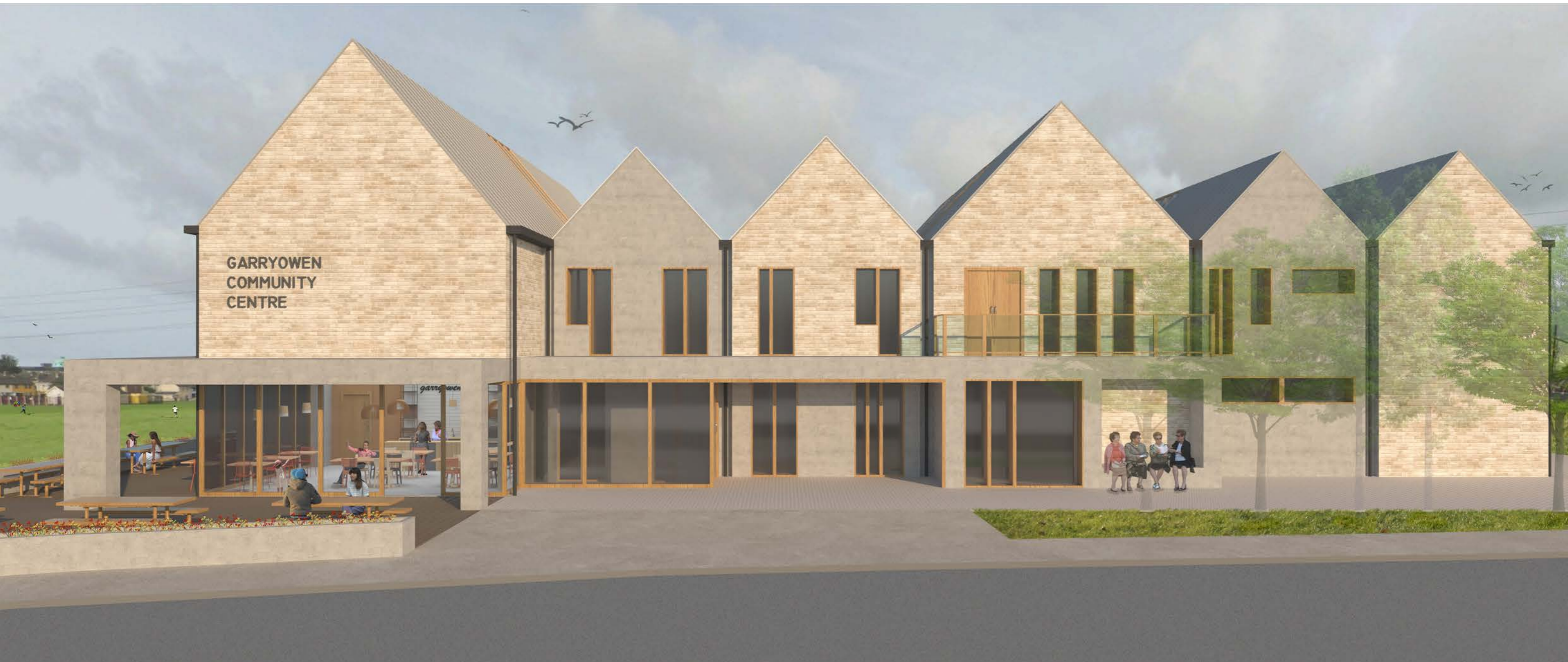
GARRYOWEN COMMUNITY CENTRE external view