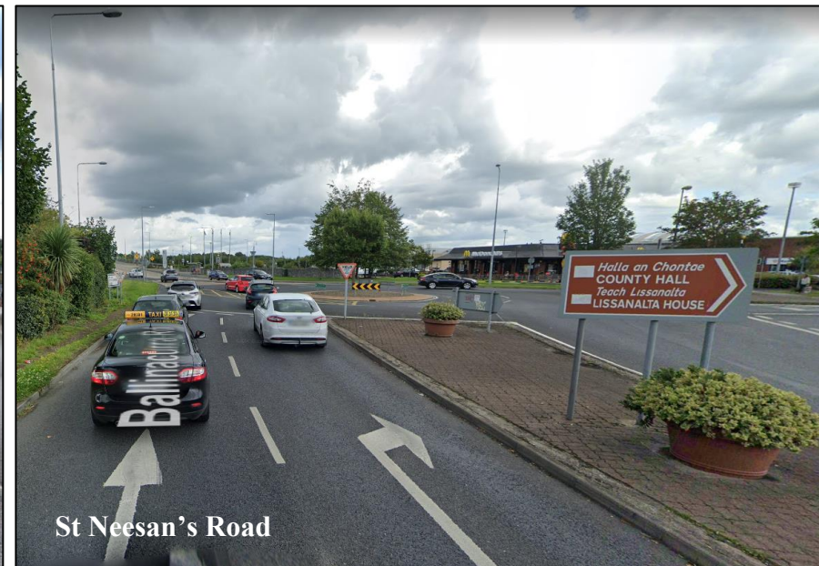
St Neesan's Road