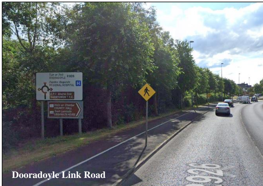
Dooradoyle Link Road

Presently, the Crescent Shopping Centre has no directional signage on the regional and local road network and customer feedback has identified issues particularly with some customers accessing Rosbrien Road instead of the Dooradoyle Link Road at the Dooradoyle Interchange and turning left towards Mulcair Road instead of right towards the shopping centre at Dooradoyle Road. Historically, the lack of directional signage was also an issue for Limerick County Council and supplementary signage has been erected on the local and regional road network to assist direct visitors to the ‘County Hall’, see graphics below.