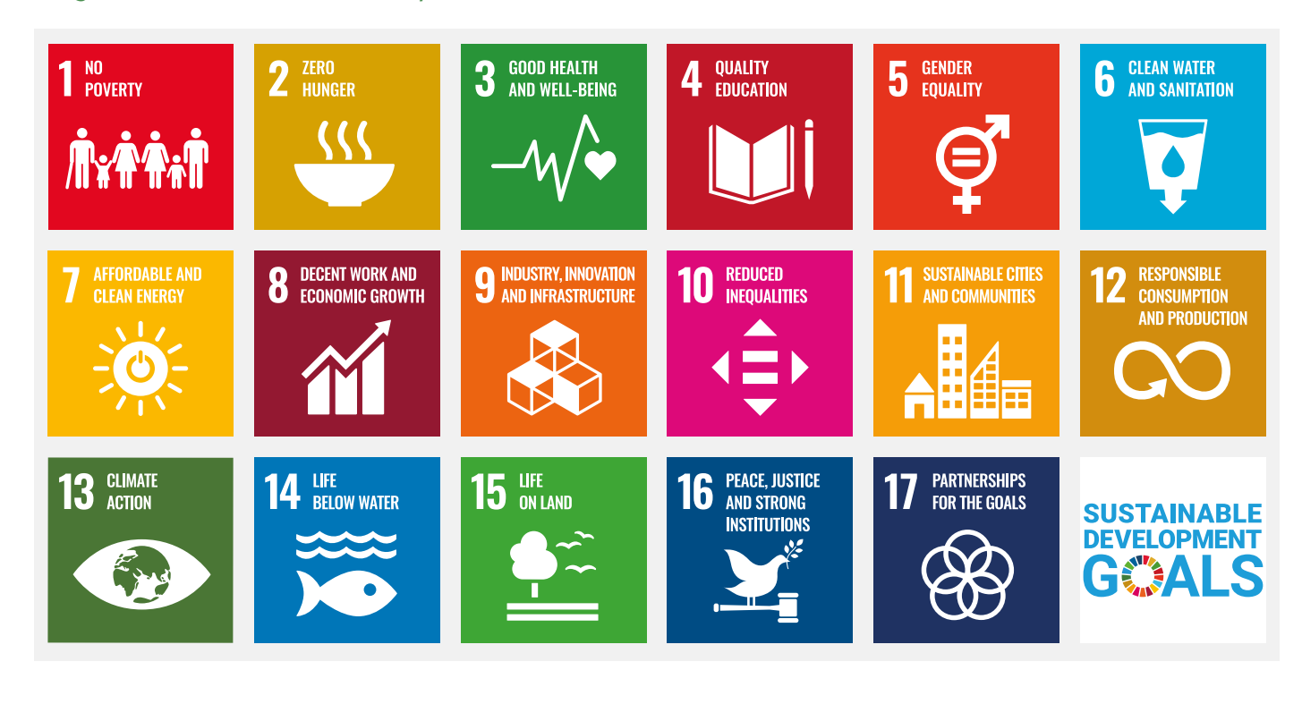
Figure 2: UN Sustainable Development Goals

The National Development Plan 2018-2027 provides the accompanying investment strategy which aligns with the strategic objectives of the NPF.