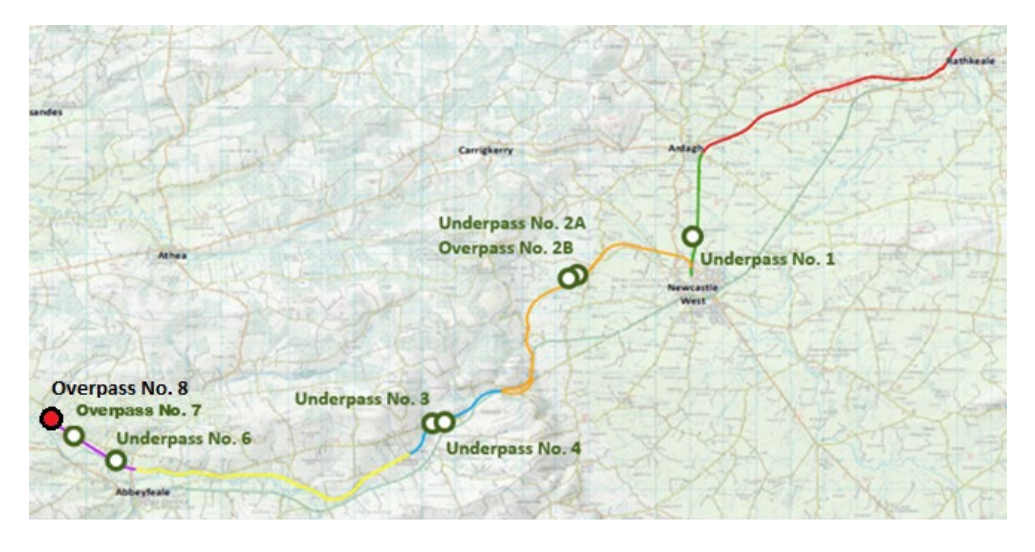
Figure 3.1: Limerick Greenway Limerick Route

This Part VIII proposal is for the installation of 1no. additional overpass on the Limerick Greenway (ST08) in the locations as outlined in Figure 3.1 below. The overall greenway route begins in Rathkeale and runs through Ardagh, Newcastle West, Barnagh, Templeglantine and Abbeyfeale. Although the greenway ends at the Kerry border under the scope of this project, Kerry County Council plan to extend it along the route of the old Limerick to Tralee rail line through Listowel, Tralee and Fenit. Once complete, a first-class walking and cycling amenity spanning much of Co. Kerry and Co. Limerick will be provided.