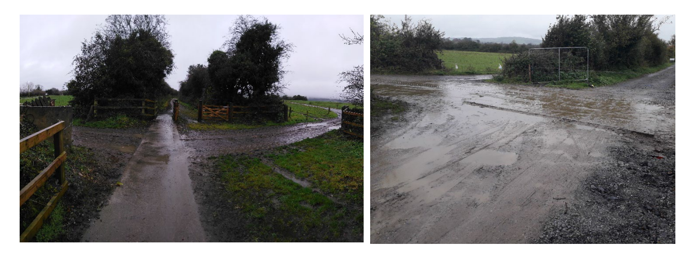
Figure 3.2: Farm Crossing Surface Condition Examples

The proposed development, subject to this Part VIII application, will include provision of 1no. cattle overpass and access controls to facilitate safe pedestrian and cycling movement at the identified farm crossing. The cattle pass will be installed above the existing Greenway path and will require earthworks and the diversion of any existing services, refer to Figure 3.3.