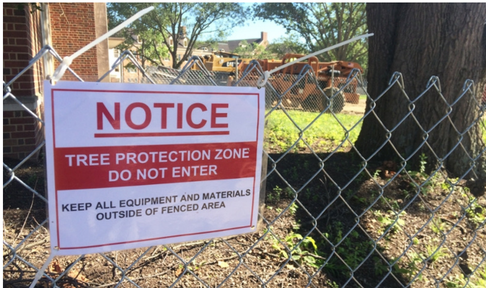
Fig. 4 Signage to be placed on all protective fencing

* The above displays an example of a suitable protective barrier as recommended by BS. 5837 2012 Trees in Relation to Construction. Recommendations.