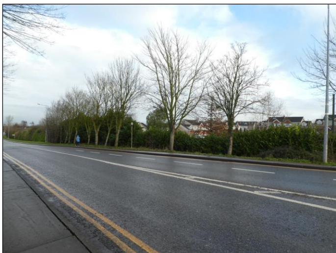
Plate 1 A line of immature trees, opposite the South Court Hotel at Raheen Roundabout to be removed, to facilitate corridor widening. These will be replaced with bulb planting.