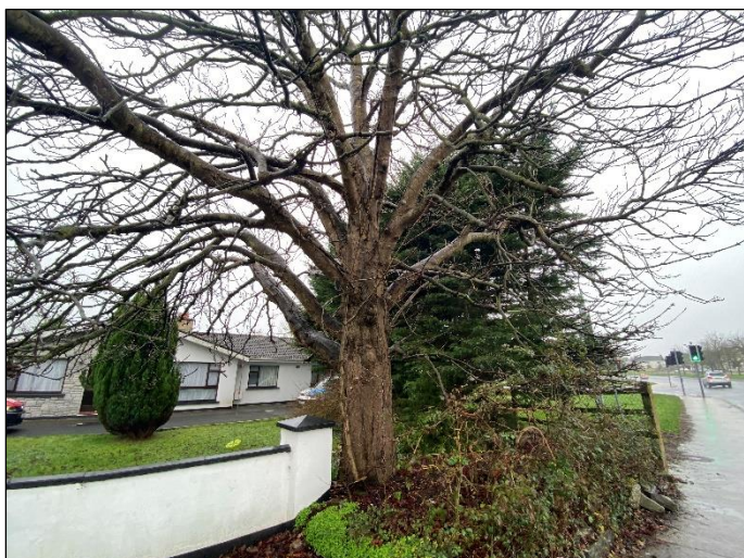
Plate 2 Mature Horse-chestnut tree just south of Mungret Gate entrance to be removed.