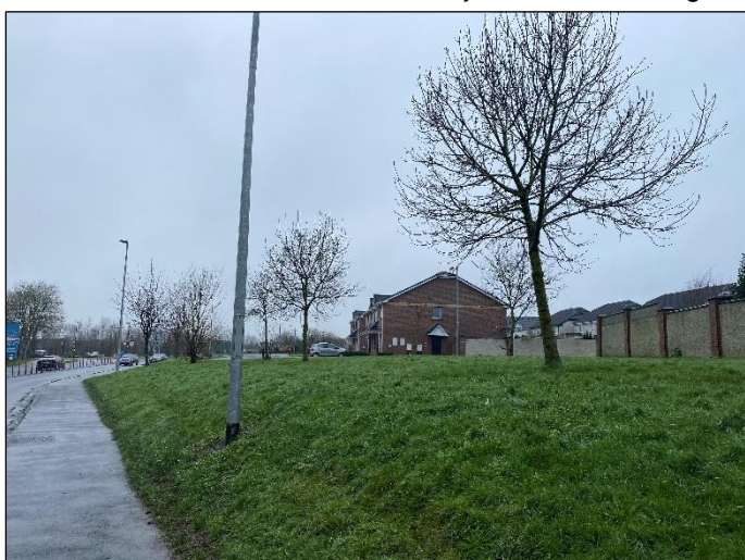
Plate 3 Area near Quinn's roundabout where native wildflower meadow will be planted as well as a specimen tree.