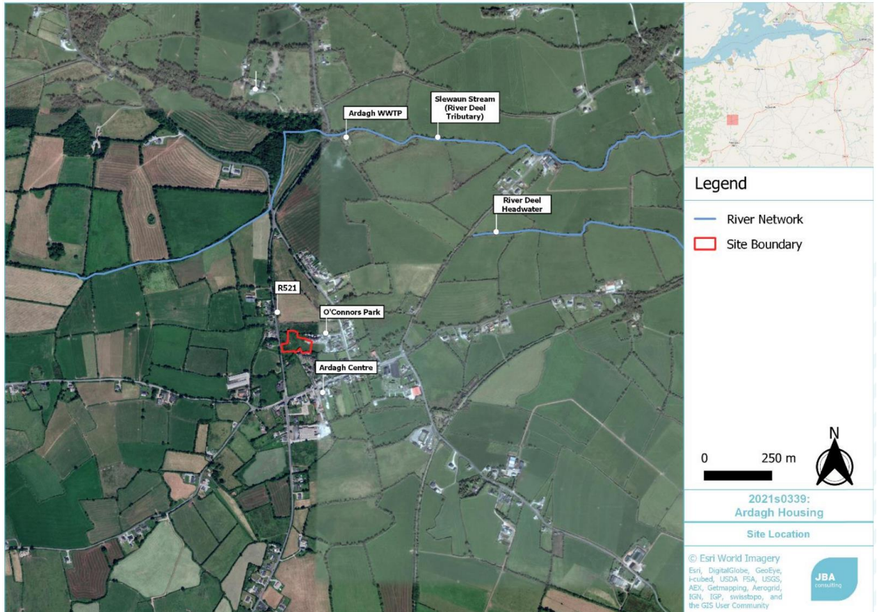
Figure 2.1: Site Location

The location for the development is O'Connor Park, Ardagh, Co. Limerick. The proposed housing development will be spread over one plot shown below in Figure 2.1, on an open space site with existing housing to the east and the R521 road to the west. Green fields are to the north and south. The site is approximately 0.40 hectares.