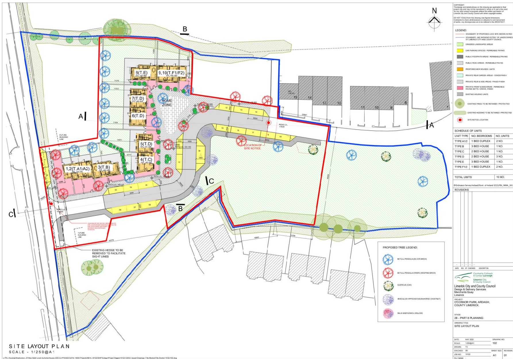
Figure 2.2: Proposed site plan