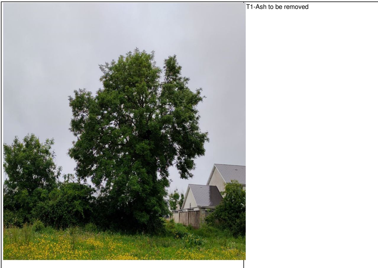
T1-Ash to be removed