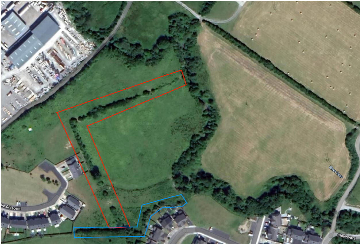
Figure 1. Site Location and extent of the scheme

The survey area is a greenfield area located to the rear of the existing Sycamore Crescent, it is devoid of any trees of significance and contains two low quality the hedgerows.