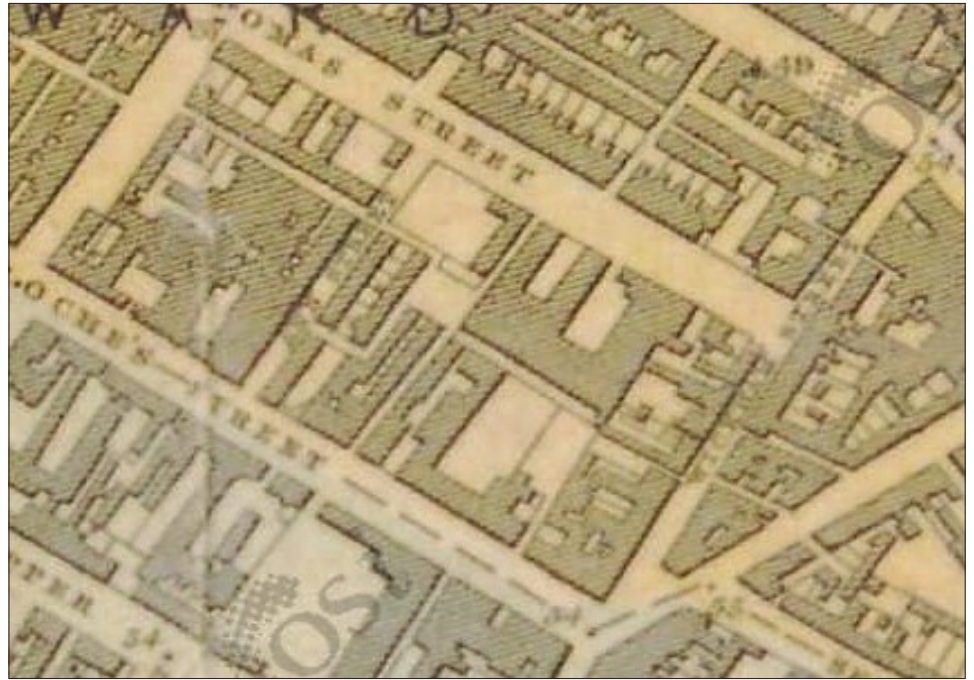
Extract from the Ordnance Survey Map of 1840-1844 shows No. 34 unbuilt

4.11 The 1870 Ordnance Survey map shows the house at 33 clearly as having a return and outbuildings to the rear and steps to the front. Number 34 is marked as a timber yard and appears to have contained several outbuildings.