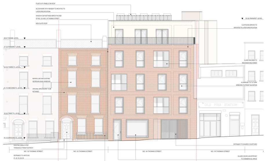
Proposed elevation to Thomas Street

5.25 The front block has a brick façade to Thomas Street, and an elevation designed as an essay in the reinterpretation of the city’s Georgian elevation in terms of the size, proportion and spacing of the fenestration. Samples of the proposed window system and balcony railings will be provided in due course to compliment the drawings and reference images hereunder.