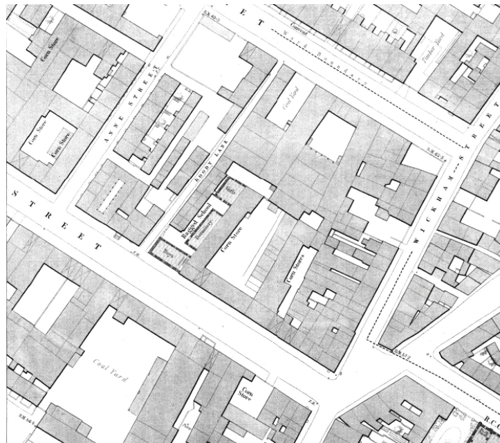
Extract from 1870 OS map showing No. 33 with building to the rear and No. 34 is noted as a timber yard

4.12 The 1897 Goad fire insurance map shows No. 33 in its present form, with No. 34 as a series of sheds or outbuildings.