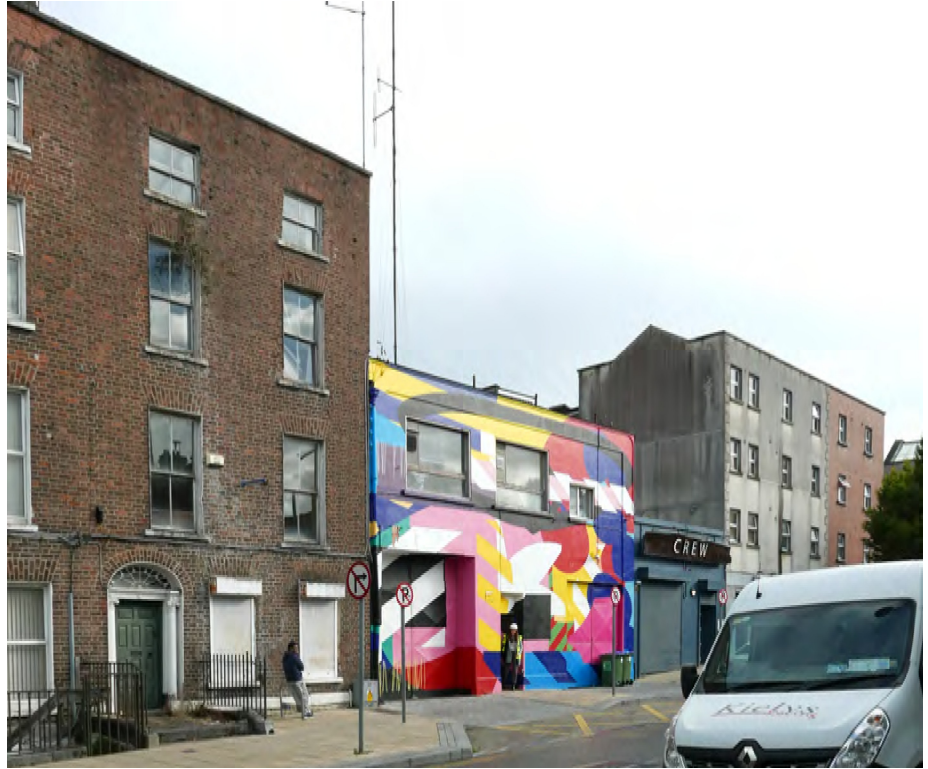
Street view Nos. 33 / 34 Thomas Street

2.14 No. 34 Thomas Street, is a two-storey twentieth-century building which was originally the city fire station, and more recently used by the Civil Defence. It has large openings on its front elevation, which has an industrial expression that is unsympathetic to the adjacent Georgian terrace.