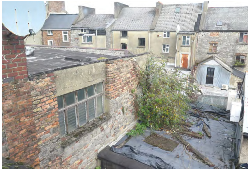
View of side elevation of No. 34 and roof of existing building at No. 35.

In summary, the two properties are vacant and derelict and ripe for redevelopment of the type proposed.