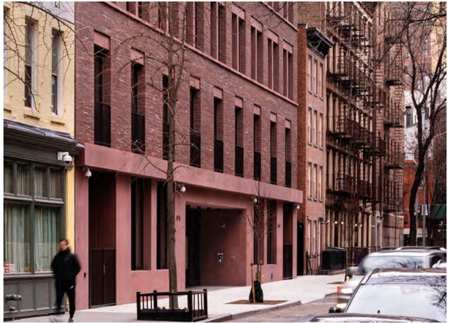
Reference Image; Jane Sterrt Apartments, New York. Chipperfield Associates.

7.11 A daylight assessment has been undertaken by Chris Shackleton Consulting. The assessment indicates that 82 per cent of the habitable rooms throughout comply with the targets set-out in the BRE's guidance document BR 209 and BS 8206-2:2008 Lighting for buildings – Part 2: Code of practice for daylighting. The details are attached.