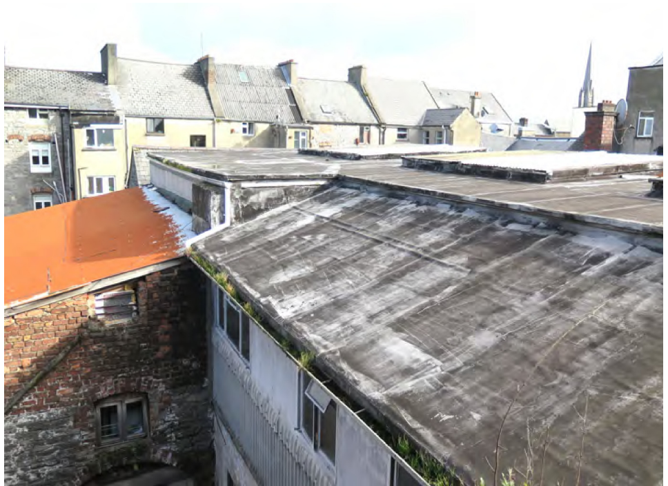
View from No. 33, looking at the rear boundary and side elevation to No. 34.