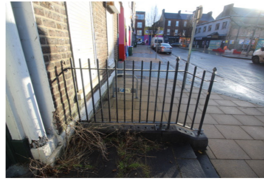
Photo 03: Lightwell to No.33 Thomas Street blocked up and Now Part of Public Pavement