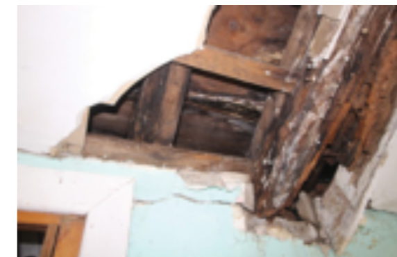
Photo 16: Third Floor Opening-up Works in Front Room to Roof Timbers