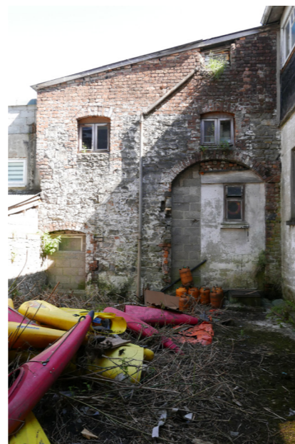
Photo 29: Two storey Brick Gable Wall to Rear Boundary of No. 33 Thomas Street