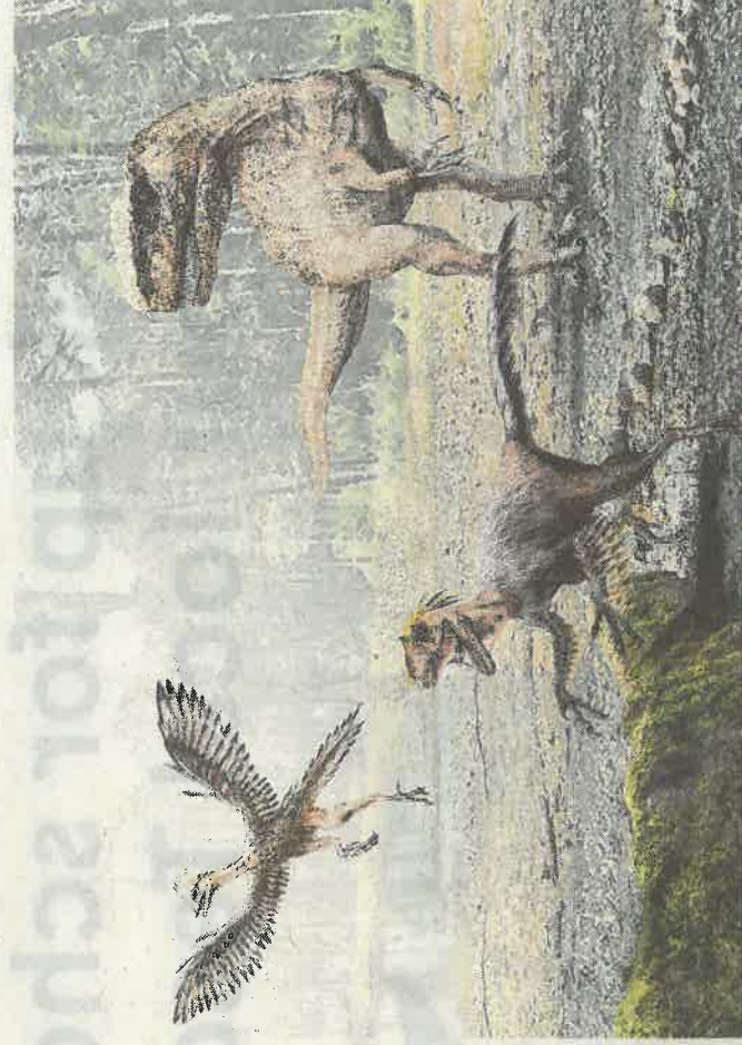
Evolution: Above, an artist's impression of theropods; below, Dr Holly Woodward analysing the bone tissue microstructures of T-rex fossils.

Their findings suggest metabolic rates rose steadily throughout most of the Early to Middle Jurassic period, around 180 to 170 million years ago. Simulations indicate a warm-blooded creature would need to shrink nine-fold to attain the same energy requirements as a cold-blooded creature of the same original body size.