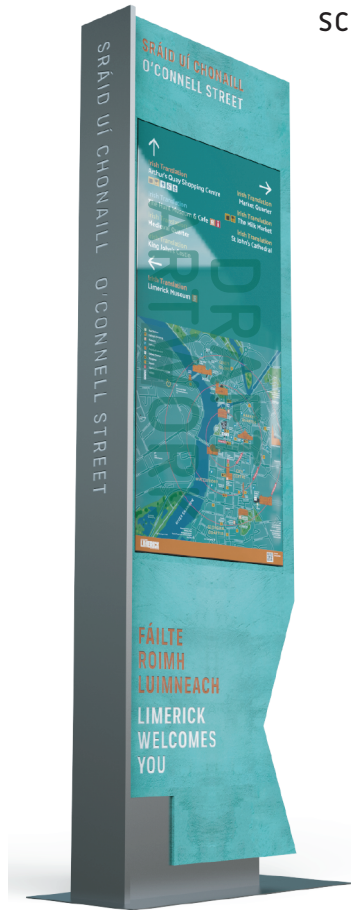
3D NOT TO SCALE