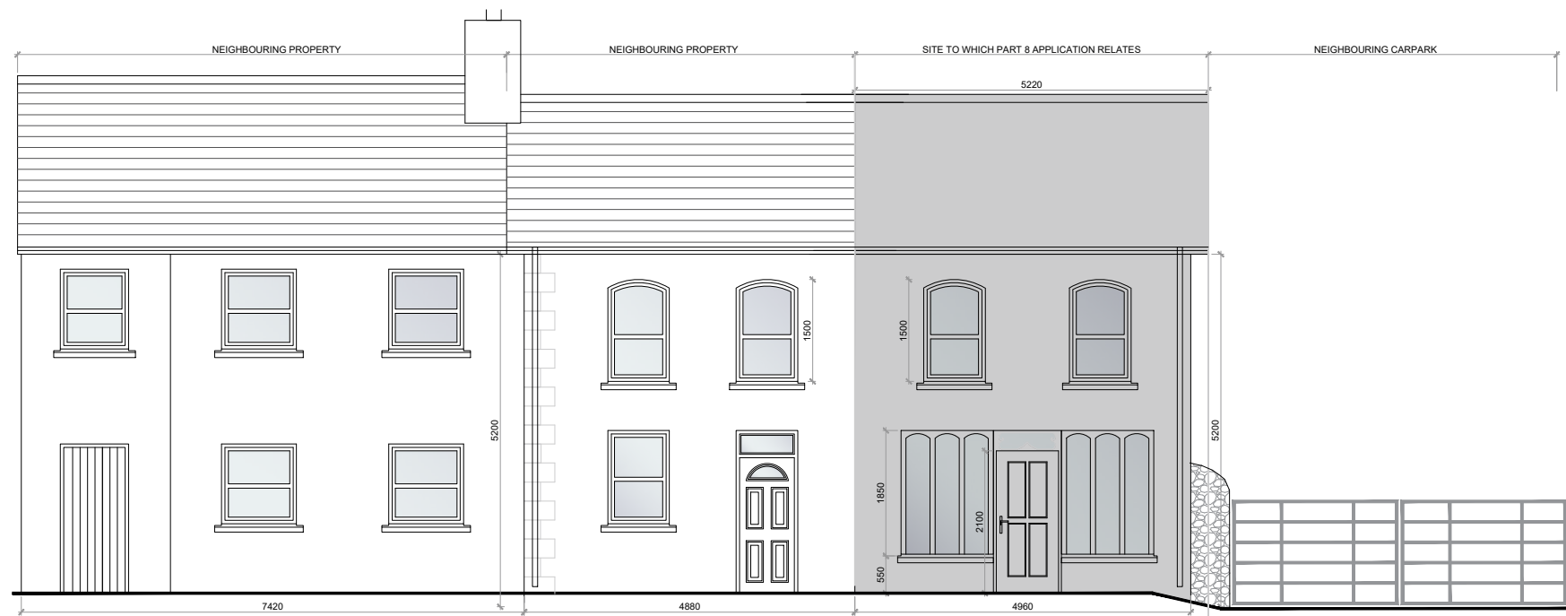
7 Contiguous Elevation Scale 1:100