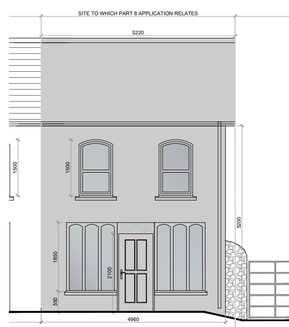
3 Front Elevation Scale 1:100