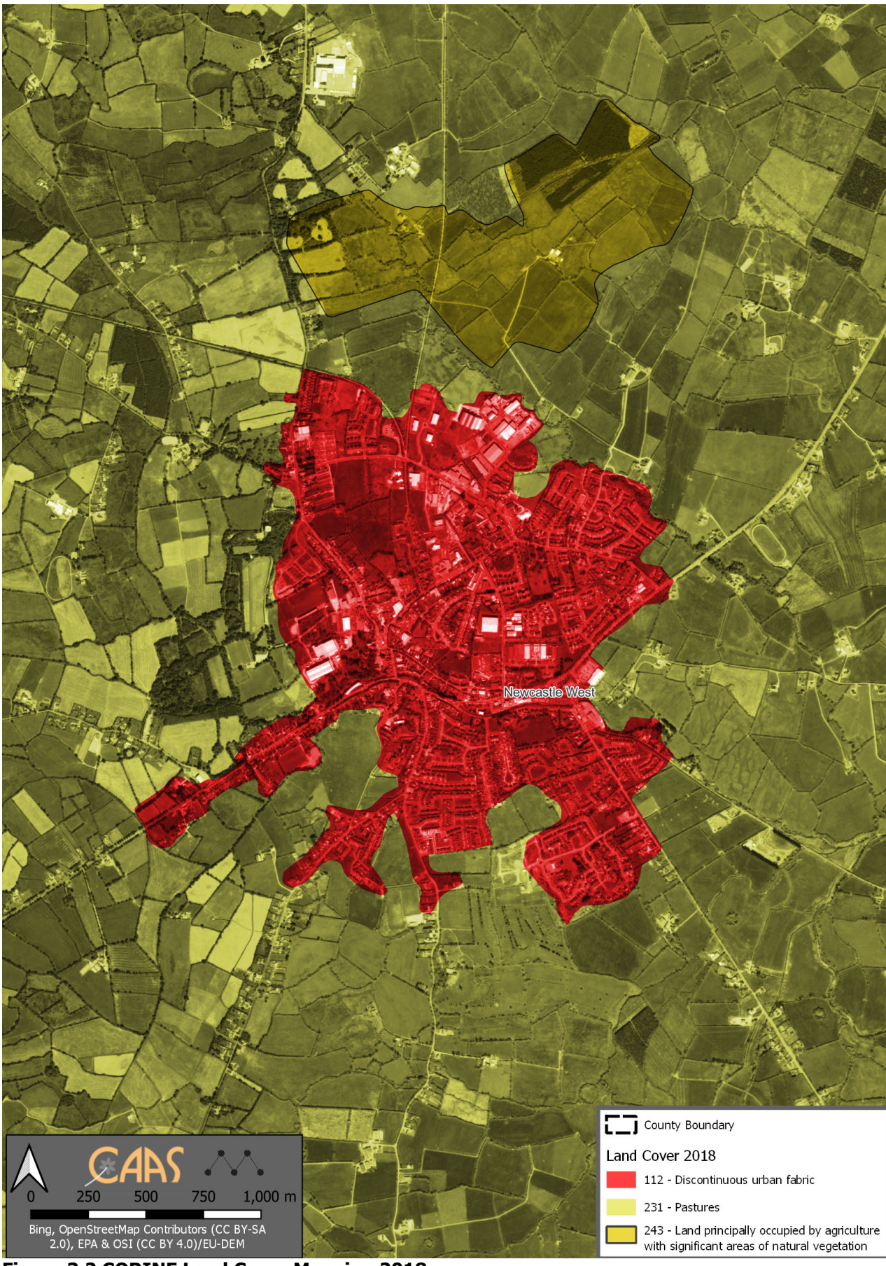
Figure 3.2 CORINE Land Cover Mapping 2018