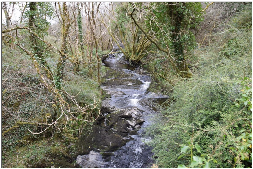
Plate 2 River Galey upstream of Ballinloughane Bridge.