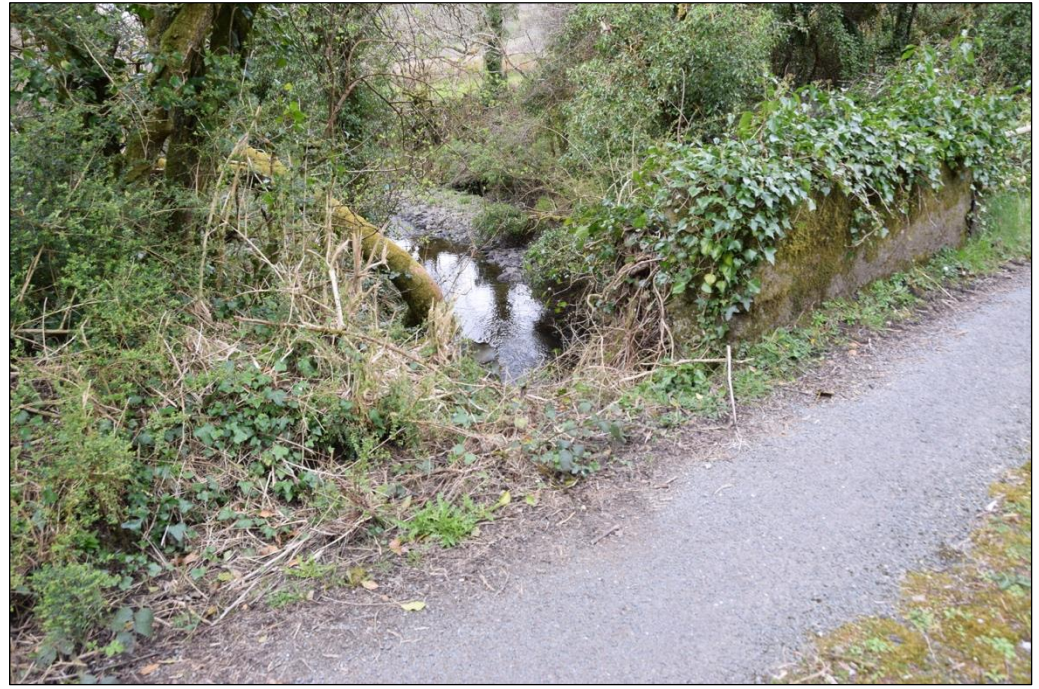
Plate 1 Ballinloughane Bridge over the River Galey in Co. Limerick.