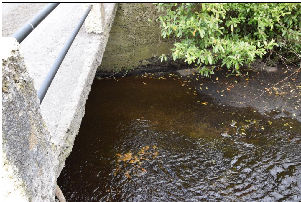
Plate 1 Mohernagh Bridge in Co. Limerick.