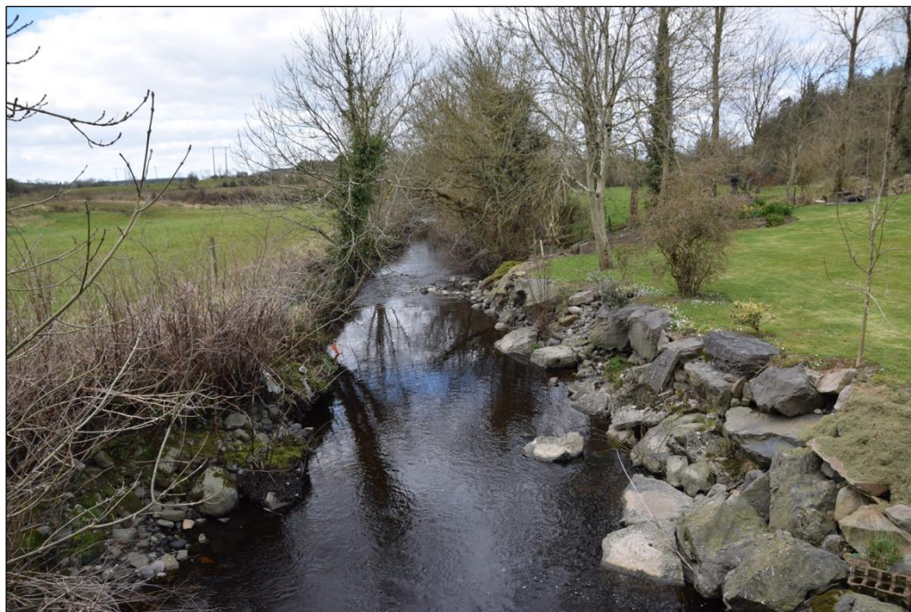
Plate 2 River Owvane at Mohernagh Bridge.