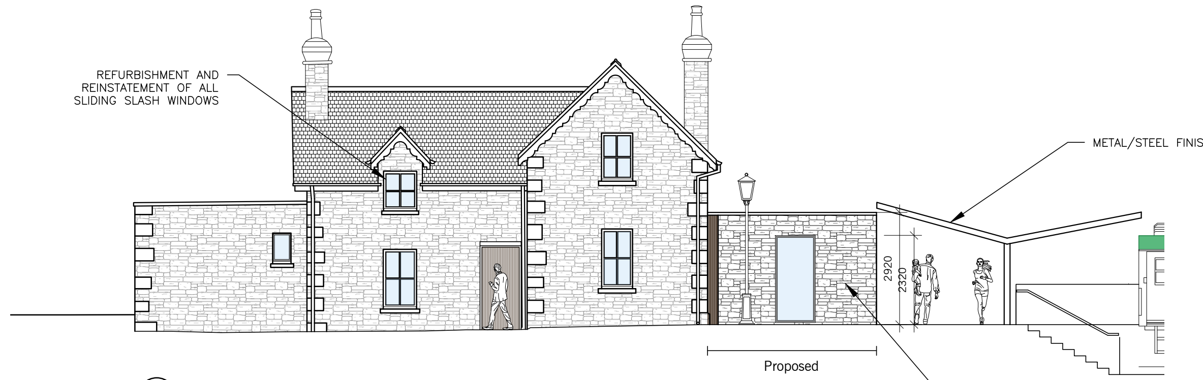
01 204 PROPOSED WEST ELEVATION SCALE 1:100