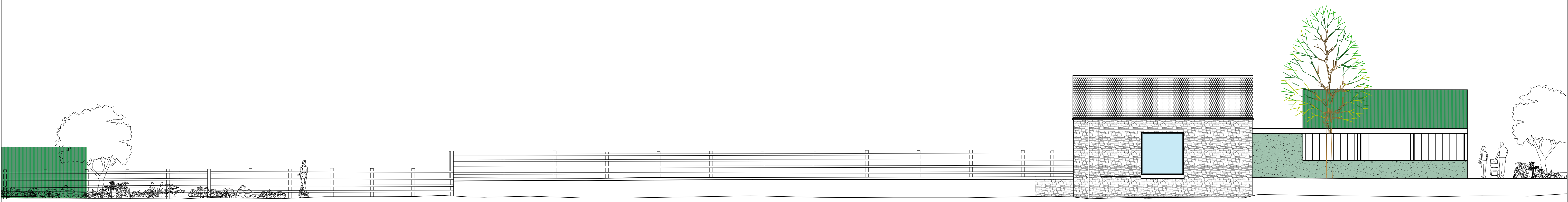
03 EAST ELEVATION (PART III) SCALE 1:100