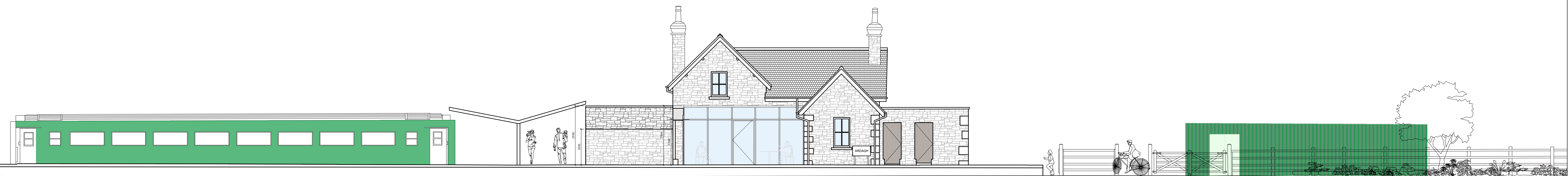
03 EAST ELEVATION (PART II) SCALE 1:100