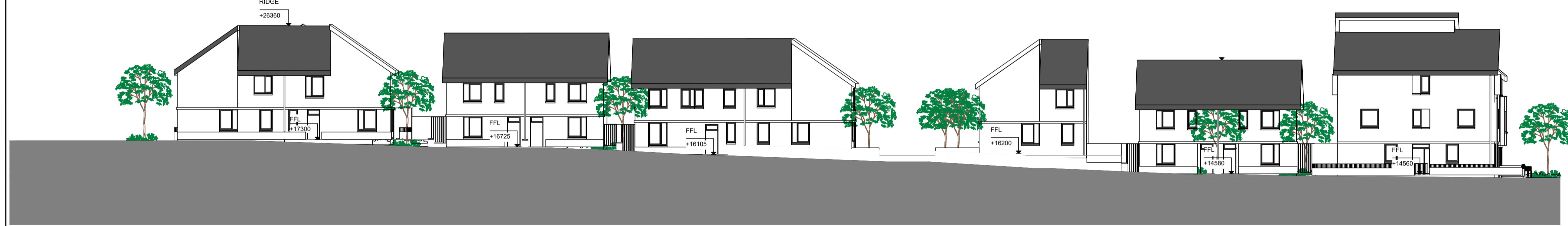
7 [Elevation DD] Scale: 1:200