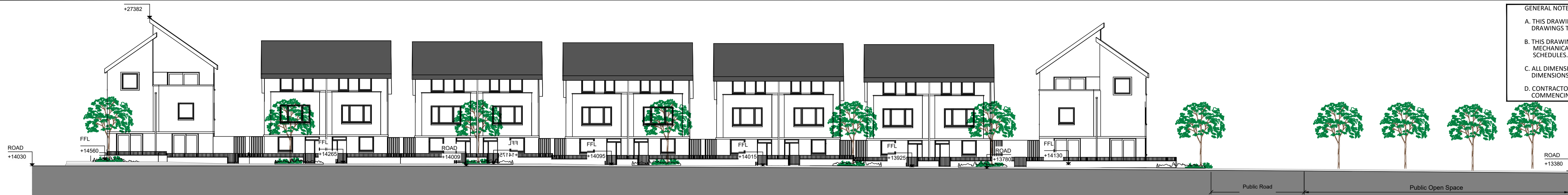
7 Elevation AA Scale: 1:200

GENERAL NOTES: A. THIS DRAWING TO BE READ IN CONJUNCTION WITH ALL RELEVANT ARCHITECTURAL DRAWINGS THE SPECIFICATION AND ALL RELEVANT STANDARD DETAIL DRAWINGS. B. THIS DRAWING TO BE READ IN CONJUNCTION WITH ALL RELEVANT CIVIL, STRUCTURAL, MECHANICAL AND ELECTRICAL DRAWINGS TOGETHER WITH THE SPECIFICATIONS AND SCHEDULES. C. ALL DIMENSIONS IN MILLIMETERS. DO NOT SCALE FROM THIS DRAWING. USE FIGURED DIMENSIONS ONLY. D. CONTRACTOR MUST VERIFY ALL DIMENSIONS ON SITE BEFORE SETTING OUT COMMENCING WORK OR PRODUCING ANY SHOP DRAWINGS.