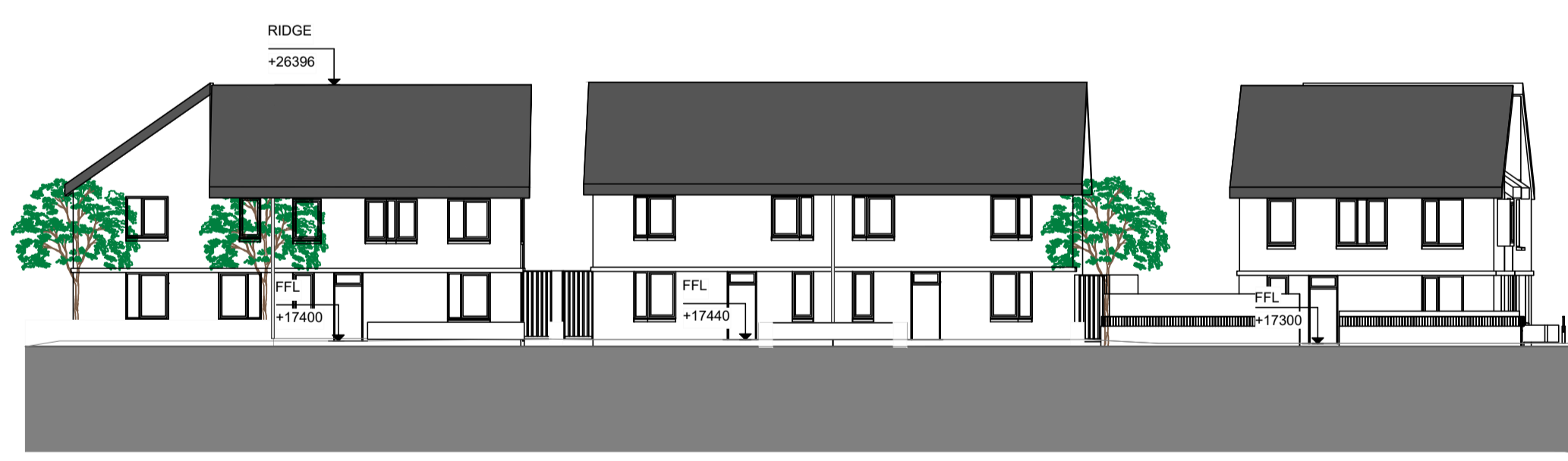
7 [Elevation EE] Scale: 1:200