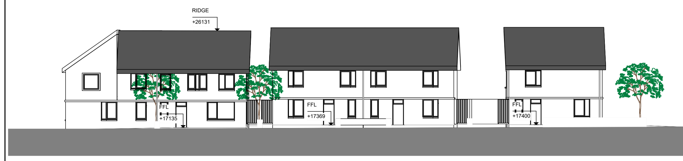
7 [Elevation FF] Scale: 1:200