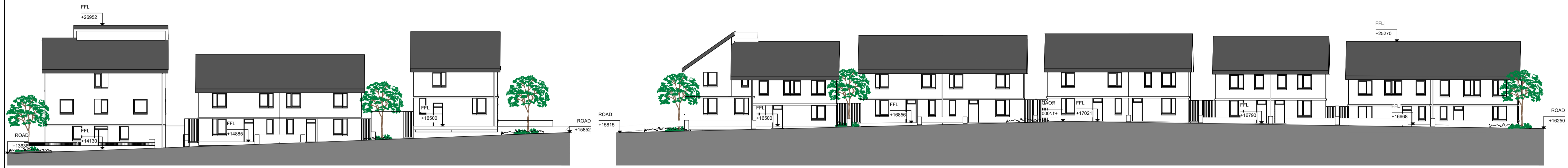
7 [Elevation BB] Scale: 1:200