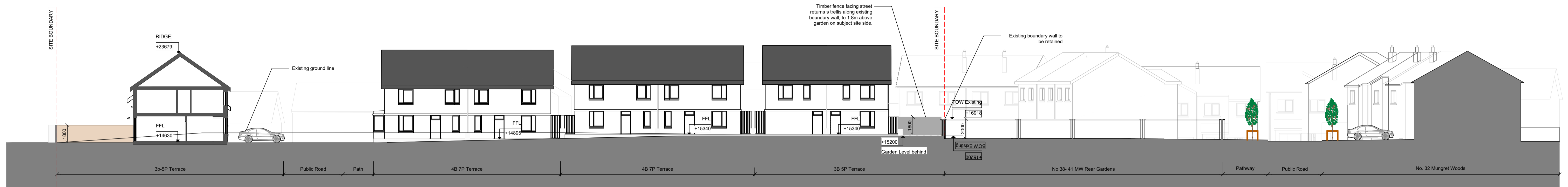
4 [Elevation CC] Scale: 1:200

GENERAL NOTES: A. THIS DRAWING TO BE READ IN CONJUNCTION WITH ALL RELEVANT ARCHITECTURAL DRAWINGS THE SPECIFICATION AND ALL RELEVANT STANDARD DETAIL DRAWINGS. B. THIS DRAWING TO BE READ IN CONJUNCTION WITH ALL RELEVANT CIVIL, STRUCTURAL, MECHANICAL AND ELECTRICAL DRAWINGS TOGETHER WITH THE SPECIFICATIONS AND SCHEDULES. C. ALL DIMENSIONS IN MILLIMETERS. DO NOT SCALE FROM THIS DRAWING. USE FIGURED DIMENSIONS ONLY. D. CONTRACTOR MUST VERIFY ALL DIMENSIONS ON SITE BEFORE SETTING OUT COMMENCING WORK OR PRODUCING ANY SHOP DRAWINGS.