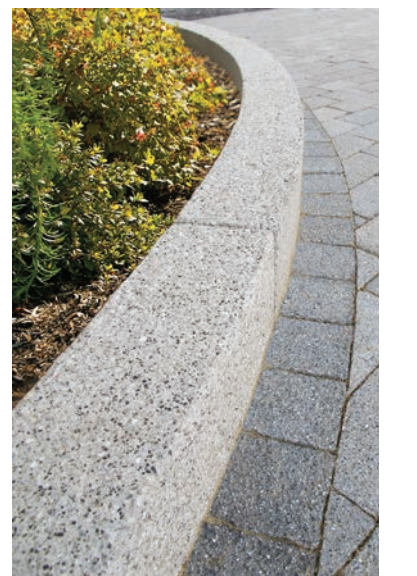
PCC kerbs with granite aggregate