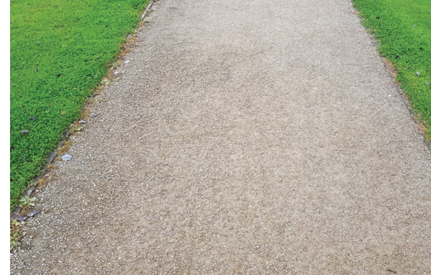
Self binding Ballylusk gravel to informal greenspace paths