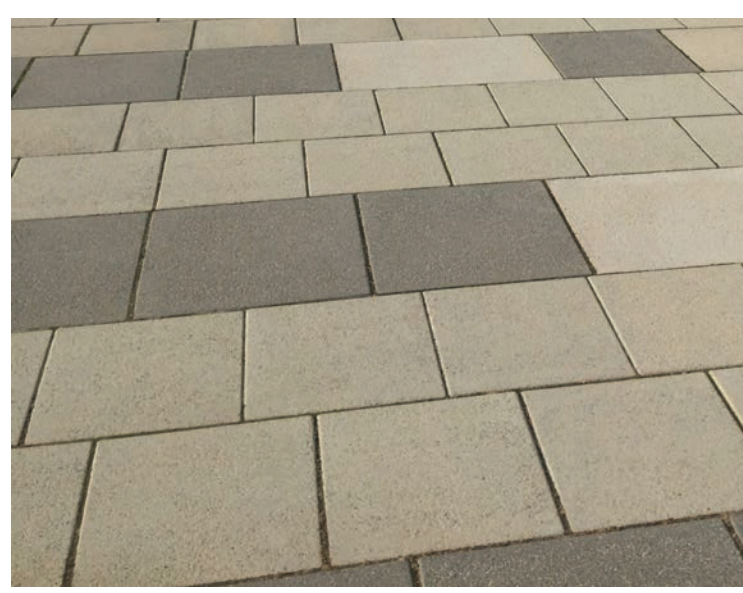
PCC textured flags to pavements