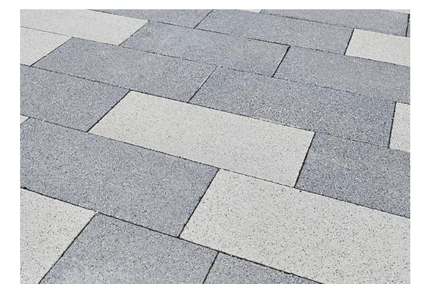
PCC slabs with granite aggregate