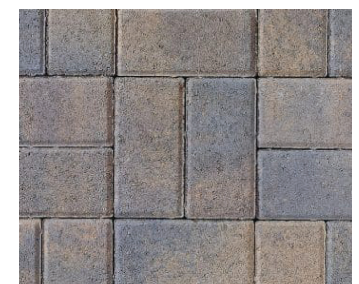
PCC heather coloured paving blocks and matching kerbs to curtilage parking spaces