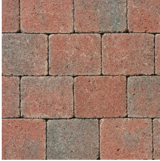
PCC pedestrian block paving to area of no vehicular access