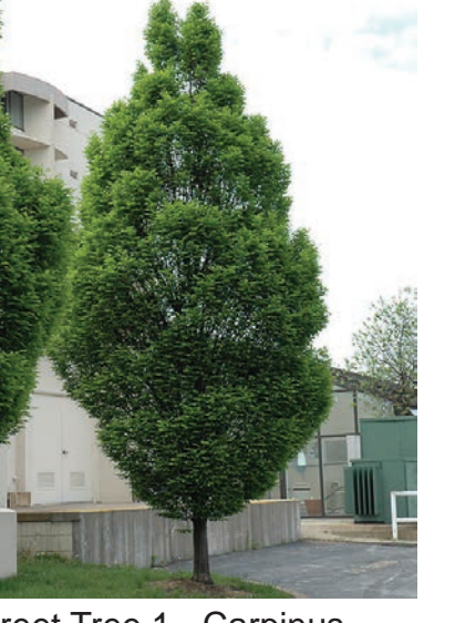
Street Tree 1 - Carpinus betulus 'Fastigiata'