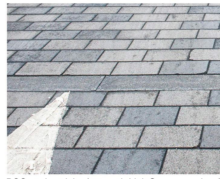
PCC paving slabs (to match Link Street crossings) at crossing locations around Main Square