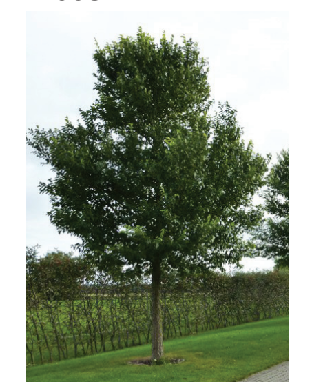
Public Square Tree -Tilia cordata 'Greensipre'