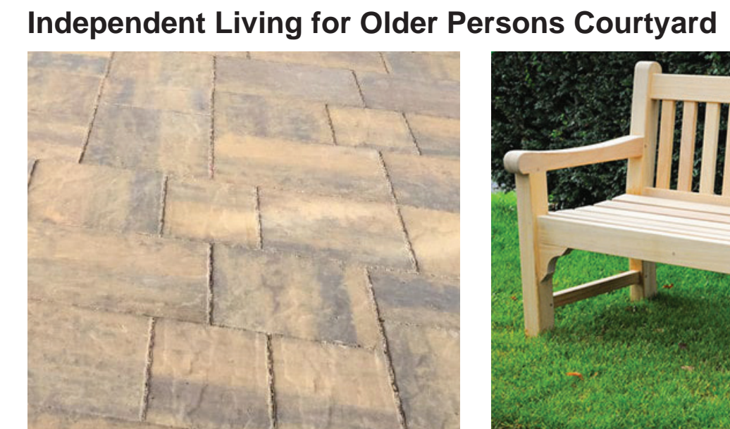
PCC historic style paving flags