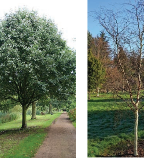
A2 Boundary Tree -Sorbus aria