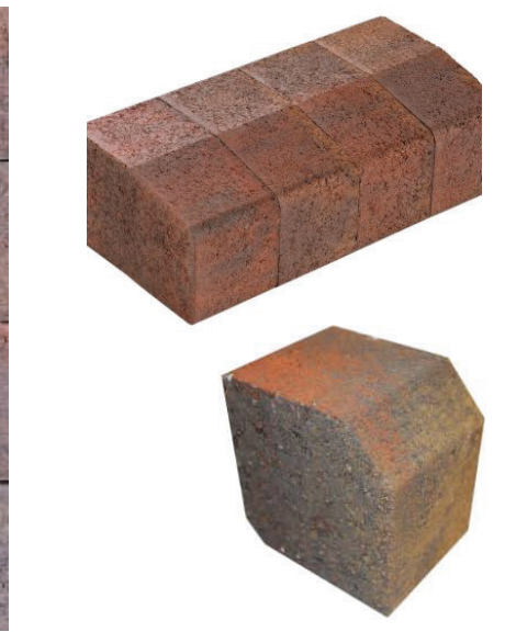
PCC bracken coloured paving blocks and matching kerbs to public parking spaces