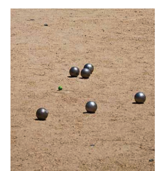
Self binding gravel petanque piste