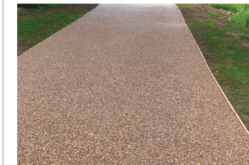
Resin bound paving to formalised greenspace paths