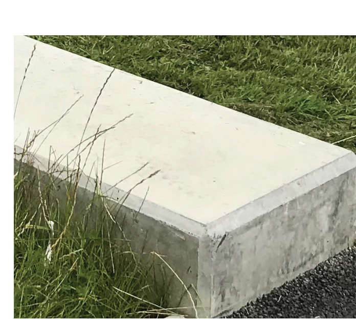
Fair faced concrete walls