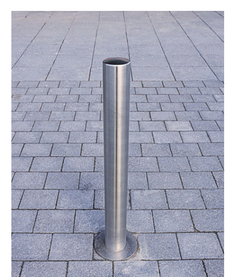
Stainless steel bollards