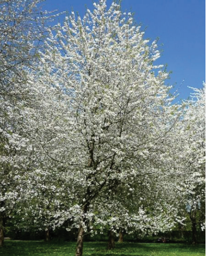
Park Tree - Prunus avium Plena