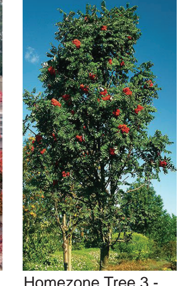
Betula pendula 'Spider Alley' Liquidambar orientalis Sorbus aucuparia 'Fastigiata'

GENERAL NOTES: 1. Do not scale this drawing.