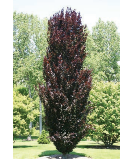
Feature Tree - Fagus sylvatica 'Dawyck Purple'