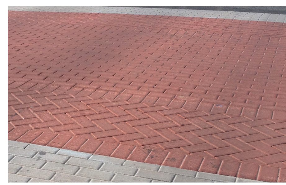
Imprinted asphalt to raised tables