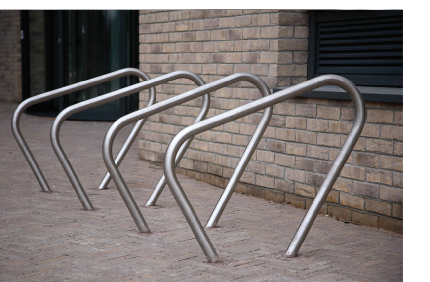
Stainless steel contemporary bicycle racks