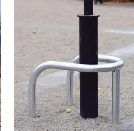
Lighting column protection for lamp posts in shared surface spaces