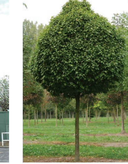
Street Tree 2 - Carpinus betulus 'Columnaris'