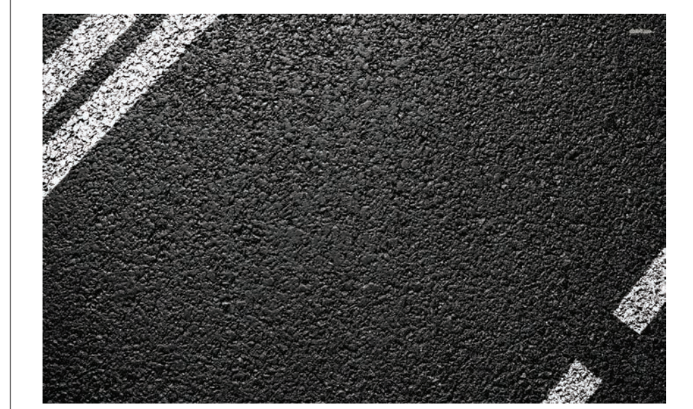
Standard asphalt for road surface