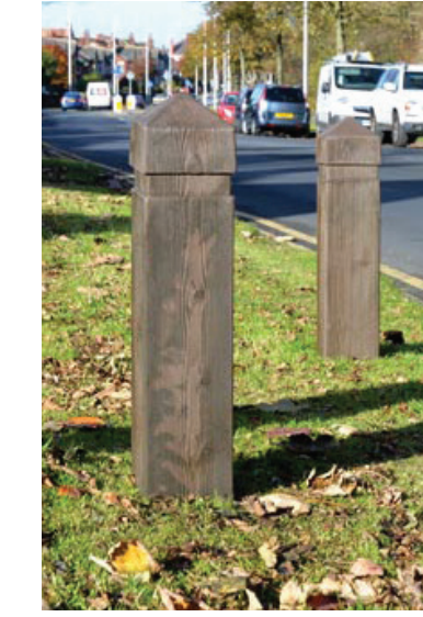
Reinforced grass to facilitate infrequent vehicular overrun Timber bollards