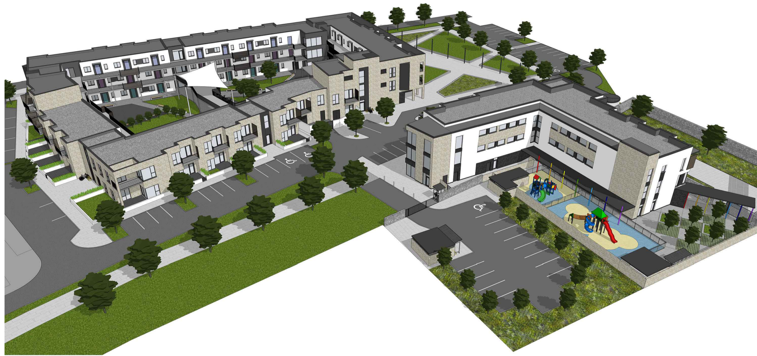
3 3D IMAGE 11 - NORTH EAST VIEW - CRECHE & COMMUNITY FACILITY 1604 n.t.s.