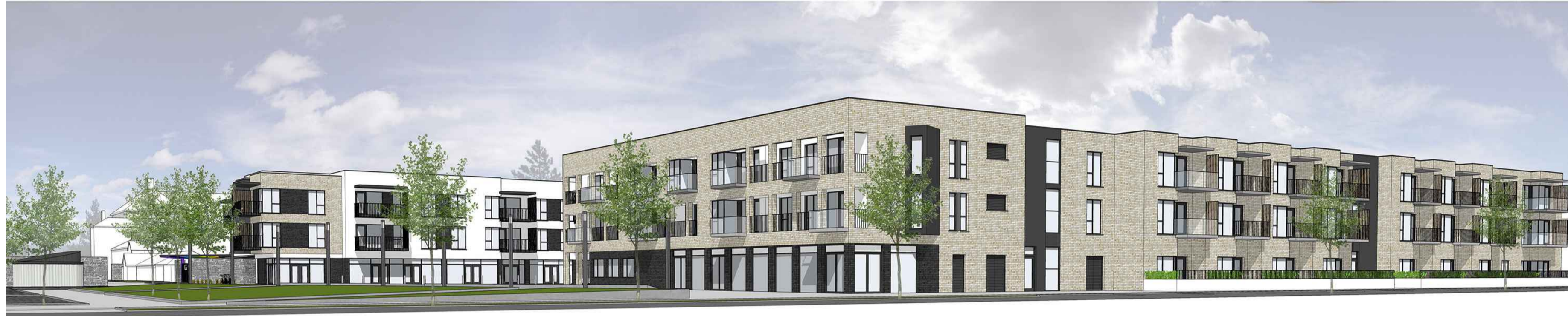
1 3D IMAGE 10 - SOUTH WEST VIEW - CRECHE & COMMUNITY FACILITY 1604 n.t.s.