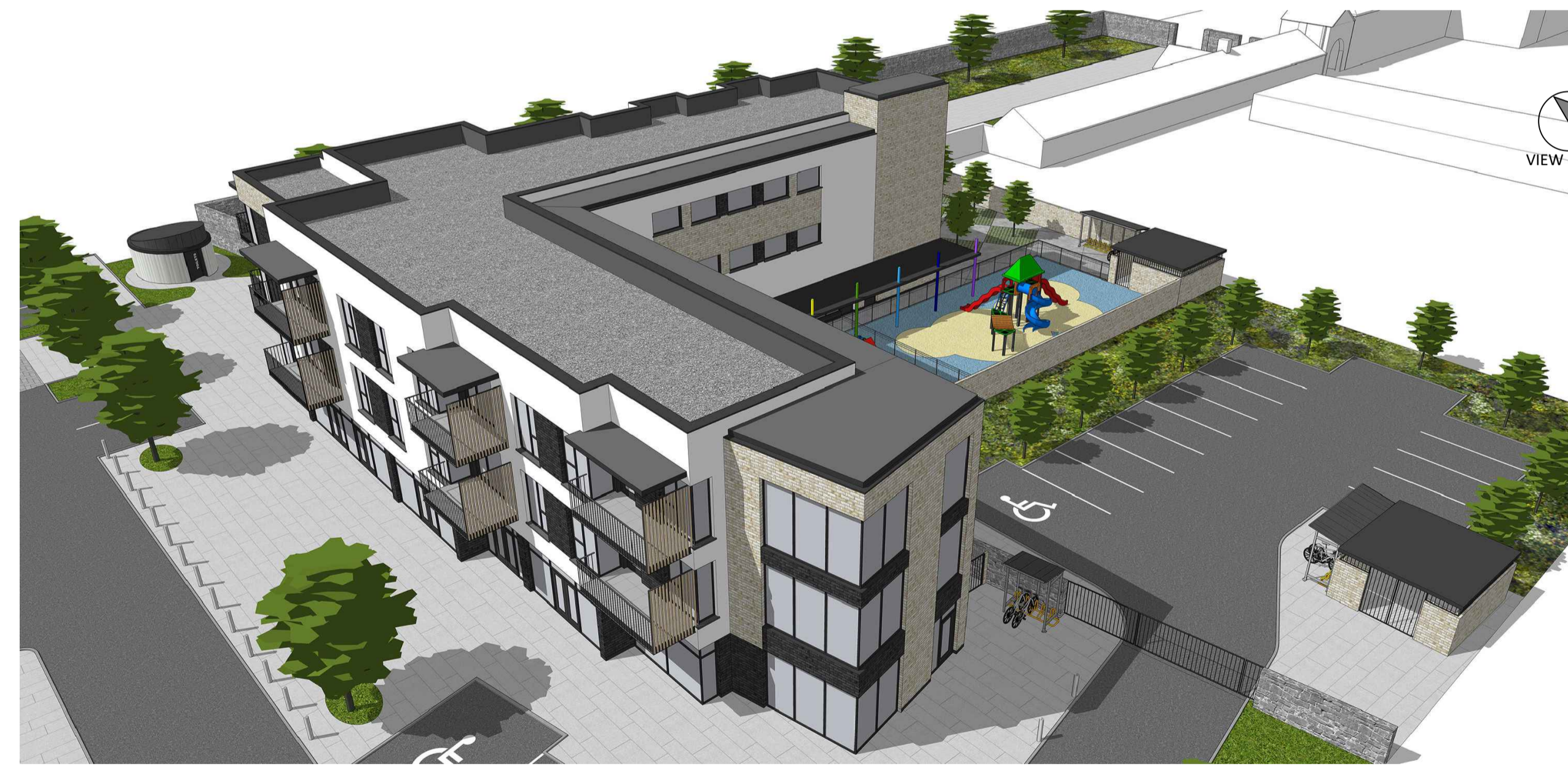
4 3D IMAGE 12 - EAST VIEW CRECHE & COMMUNITY FACILITY 1604 n.t.s.