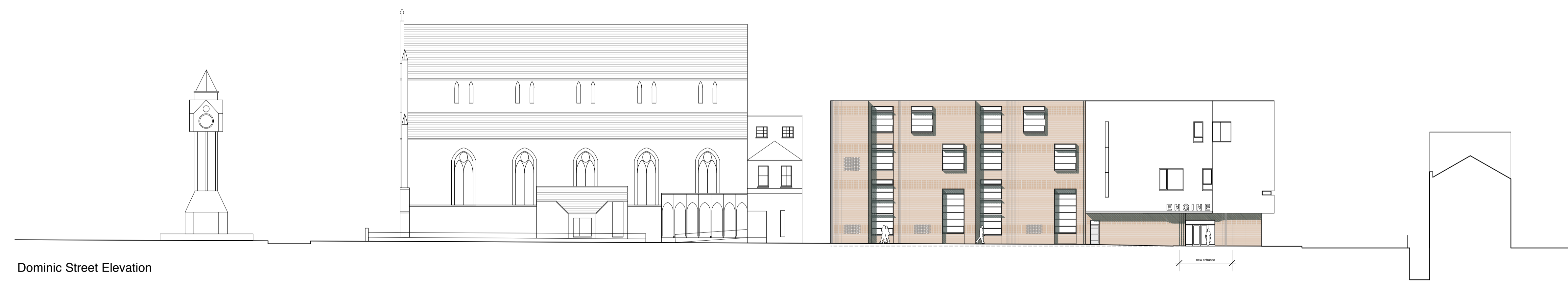
Dominic Street Elevation